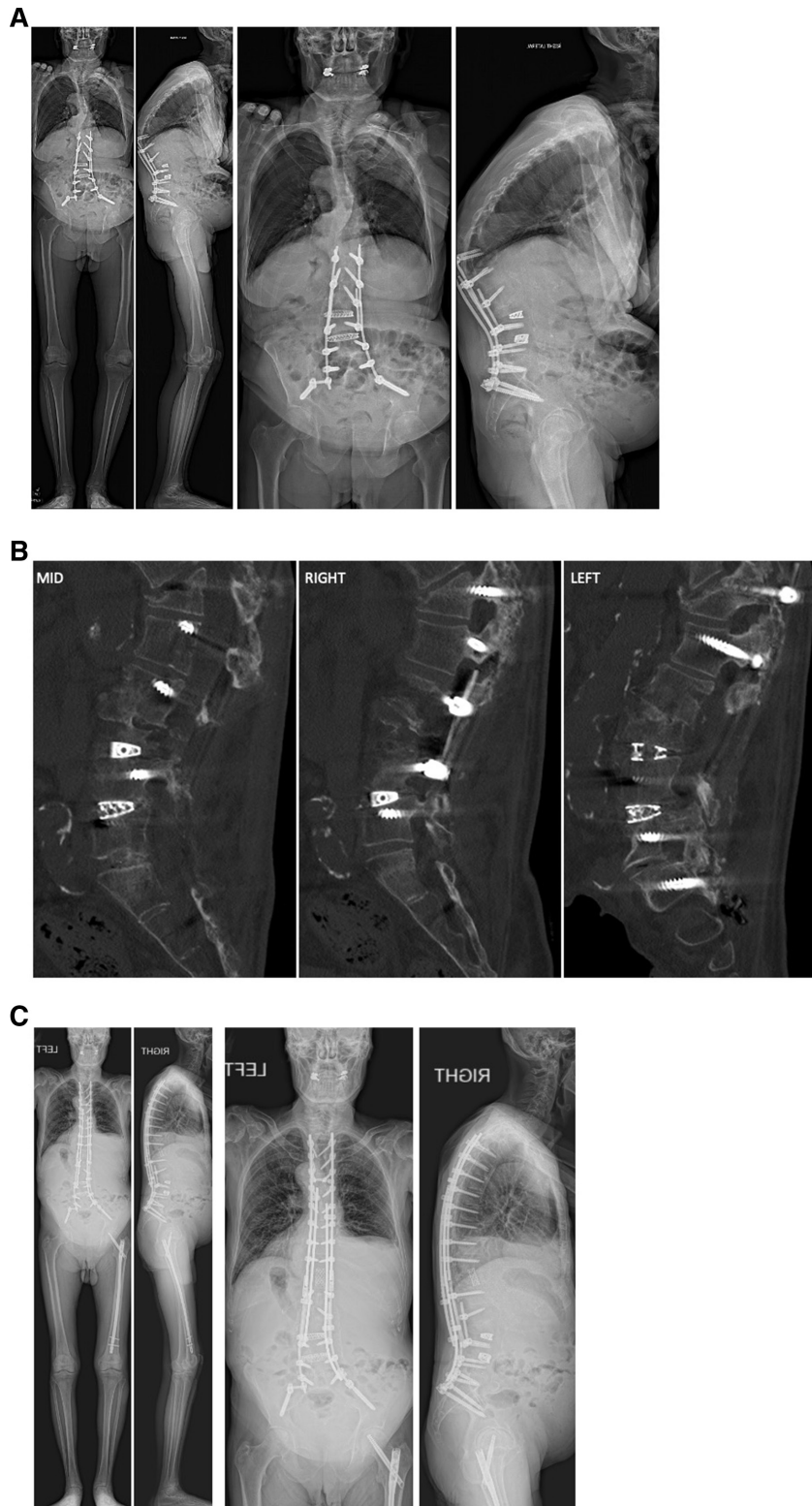
Figure 3. (A) Preoperative x-ray images show prior T12-S1/pelvis fusion with proximal junctional failure (PJF). There is a positive sagittal imbalance secondary to PJF. PI 35°, LL 27°, PI-LL 8°, PT 30°, SVA 182 mm, and PJA 50°. (B) Lumbar computed tomography image showed a T12 compression fracture, an L5-S1 pseudarthrosis, and an otherwise solid fusion mass T12-L5. (C) 2.5-year postoperative x-ray images after revision posterior spinal fusion with instrumentation T4-S1/pelvis and T12 VCR. Alignment parameters show that the pelvic tilt has normalized, and global sagittal alignment has improved without evidence of recurrent proximal junctional kyphosis. PI 35°, LL 27°, PI-LL 8°, PT 12°, and SVA 107 mm. PI, pelvic incidence; LL, lumbar lordosis; PT, pelvic tilt; TK, thoracic kyphosis; SVA, sagittal vertical axis; PJA, proximal junctional angle.