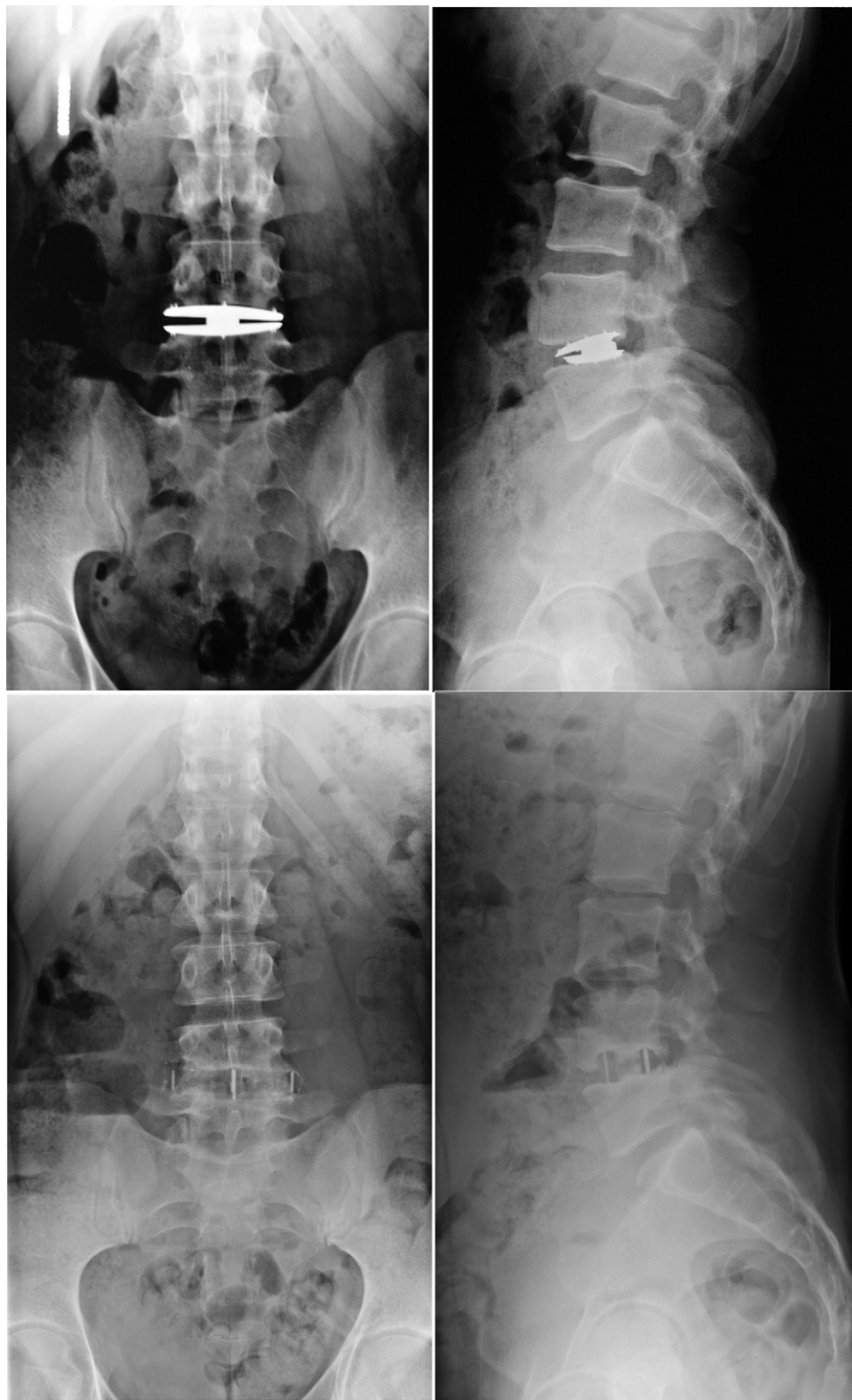
Fig. 4. Case example of lateral disc revision showing 24-month follow-up images (top) and post-XLIF images (bottom).

The second patient presented with axial rotation of the superior endplate that initially did not affect pain and function.