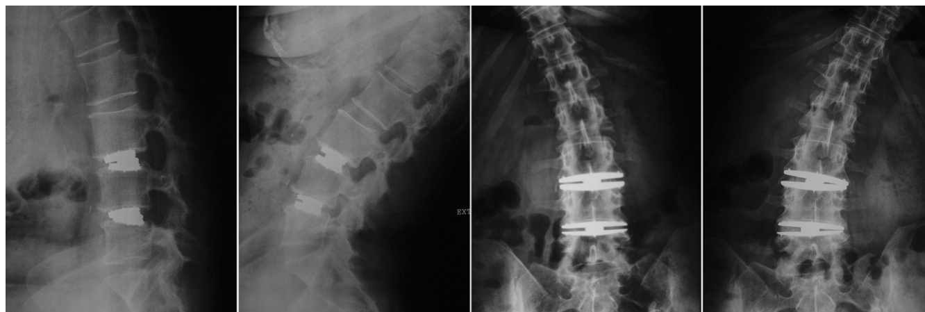
Fig. 2. Case example of 2-level lumbar arthroplasty showing dynamic X-rays at 36-month follow-up.

Removal of the TDR device and revision to fusion by the same surgical approach were required in 2 cases (5.6%). The first patient presented with postoperative imaging showing that the caudal endplate of the TDR device was slightly oblique. At the 12-month follow-up