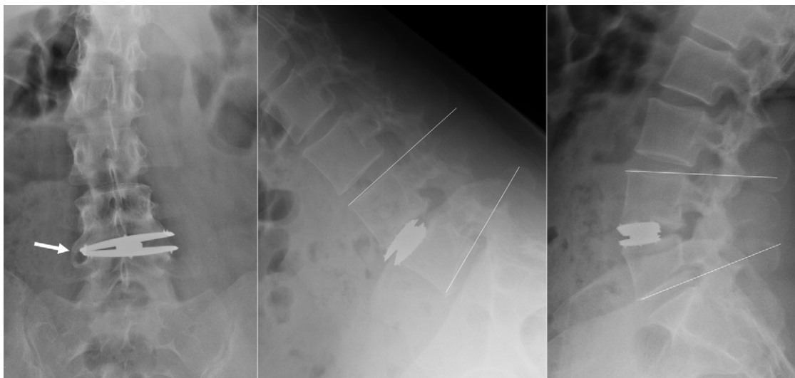
Fig. 5. Case example of grade IV heterotopic ossification. Contralateral bone formation is shown by the arrow. Fusion at the index level is evidenced by the dynamic X-rays.

At the 6-month follow-up visit, the patient reported a significant increase in pain and conservative care was administered. Twenty months after surgery, the patient decided to undergo revision of the prosthesis through the XLIF approach (Fig. 4).