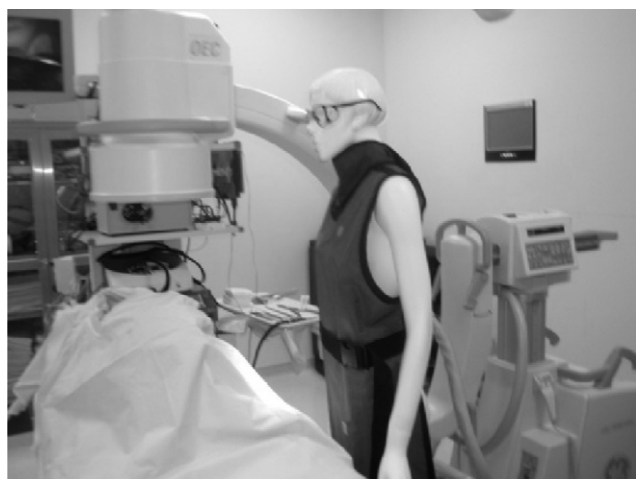
Fig. 4. Reversed setup: lateral image.

Abbreviations: RS, reversed setup; SS, standard setup; SSP, standard setup in pulsed mode.