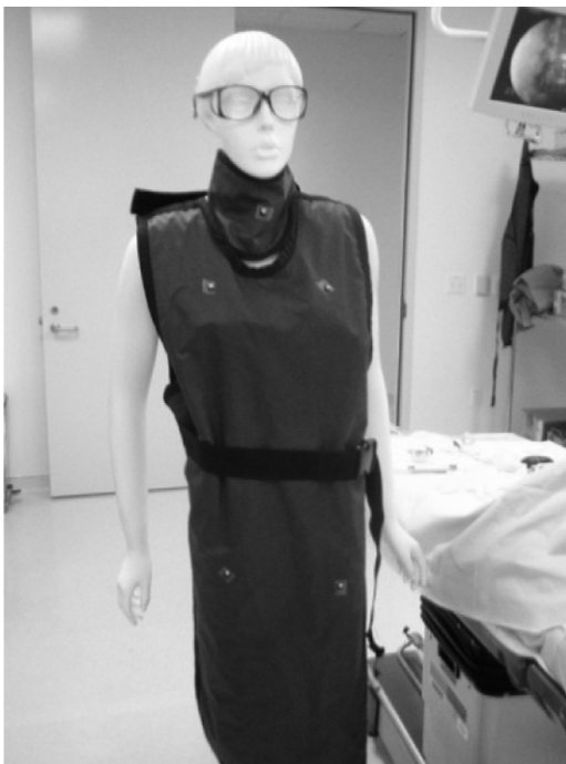
Fig. 1. Mannequin with dosimeters.