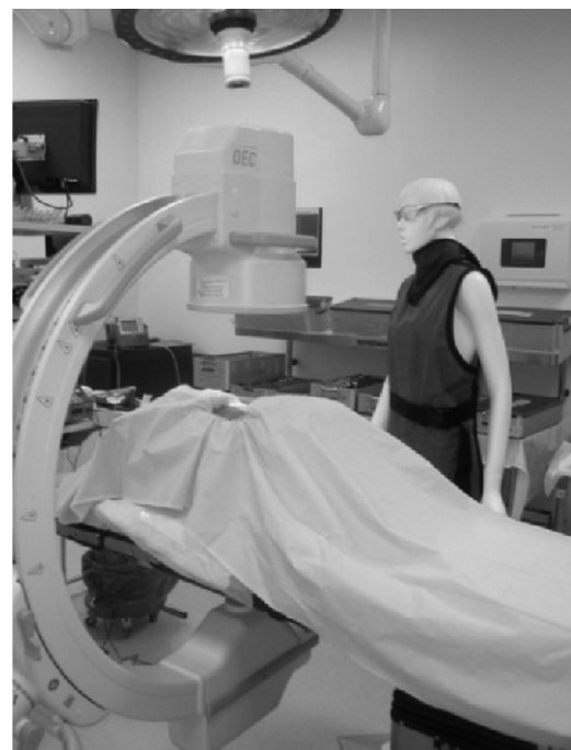
Fig. 3. Standard setup: lateral image.