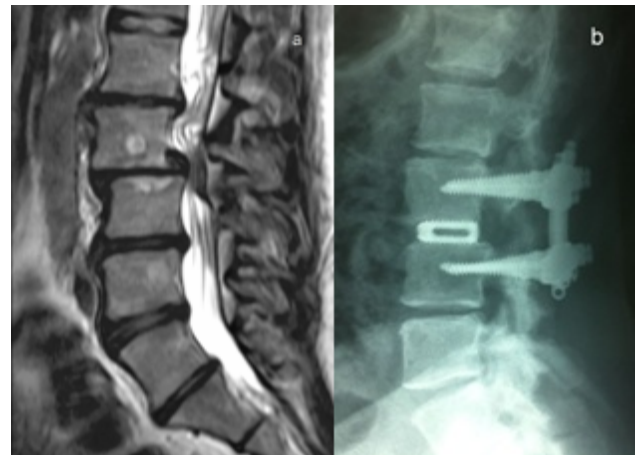
Fig. 1. Case 15. A 41 year old man with Grade II degenerative spondylolisthesis, Level L3-L4. (a), the preoperative sagittal T2-weighted MRI illustrates the spondylolisthesis and the retroprolusion of the intervertebral disc. (b), the 48-72 h postoperative sagittal radiograph shows PLIF + IPLF, with restoration of the disc space height and improvement of the spondylolisthesis.

The clinical evaluation of preoperative and postoperative back pain and sciatica was carried out by means of the visual analogical scale (VAS) of pain, a subjective unidimensional scale that extends from 0-10, with "0" as the absence of pain and "10" as the existence of the maximum pain. 9 The total clinical result