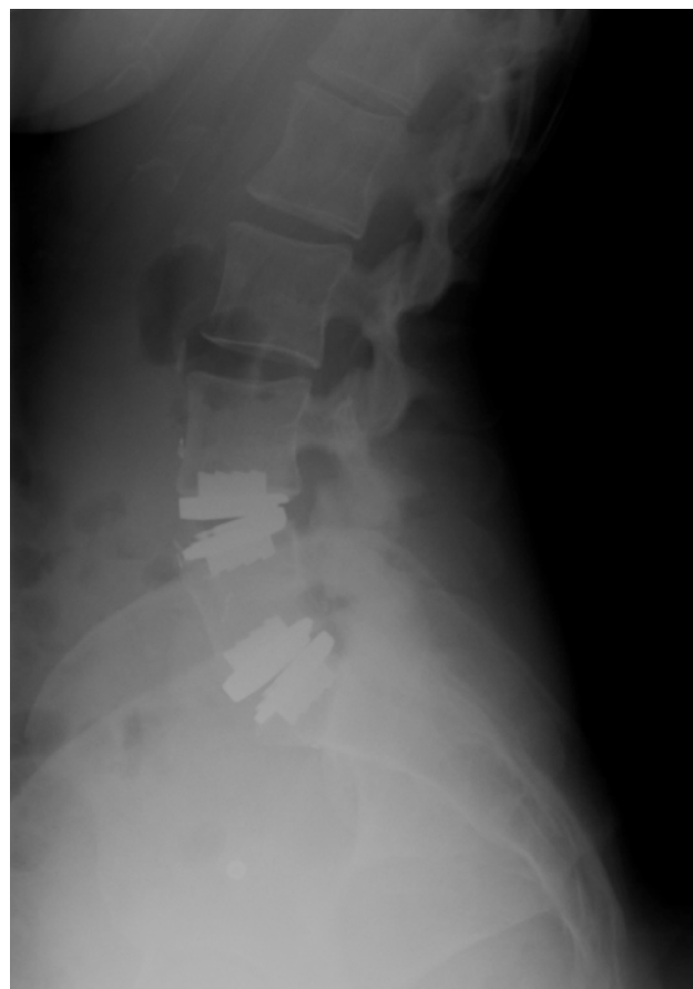
Fig. 4. Area of focal spinoous process impingement at the L4-5 level after disc replacement at L4-5 and L5-S1 levels.

The anterior approach to the lumbar spine has been a well-established and accepted procedure for patients requiring fusion and disc replacement. However, there are several complications that are associated with this approach. Several issues, such as injury to the vasculature, kidney and bowel; as well as the potential for deep and superficial infection, hernia,