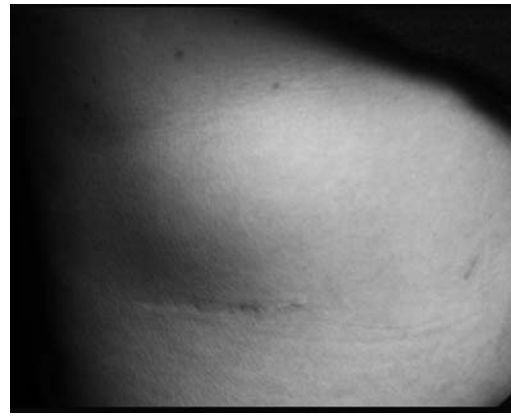
Figure 3. Clinical picture showing globular swelling in healed surgical site area.

Through a laparoscopic portal, a 2 cm by 2 cm defect was visualized in the transversalis fascia. The fibers of the obliques could be seen through the hernia window. The closure was performed with polypropylene mesh secured with staples and stitches (Figure 3). The tone of the abdominal wall in the hernia region was found to be normal. There were no atrophic or atonic changes. The patient's lateral abdominal pain improved postoperatively. There has been no recurrence of the hernia or any