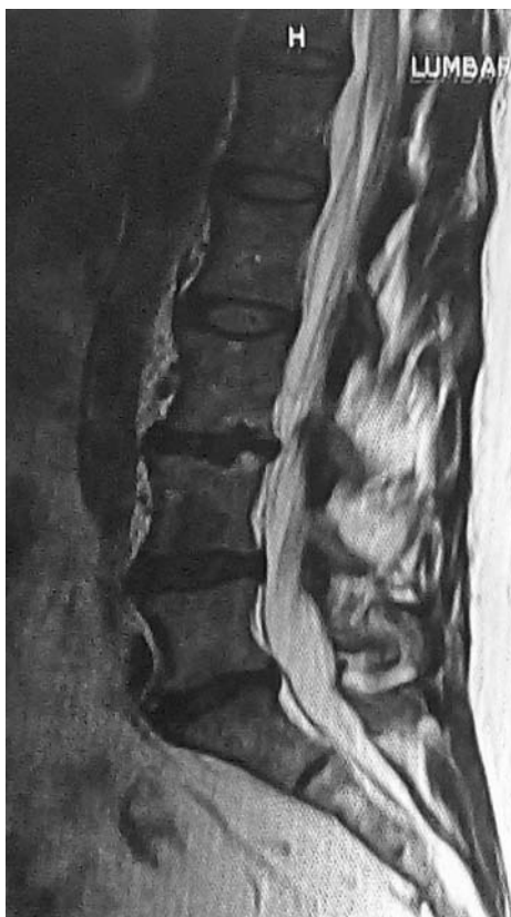
Figure 1. Magnetic resonance image showing lumbar degenerative disc disease with L3-4 stenosis.

had some degeneration at L4-5 and L5-S1. To ensure that the L3-4 level was the main pain generator, provocative discography was done with proximal and distal controls, confirming the L3-4 level as the primary pathology. We offered her either a minimally invasive transforaminal lumbar interbody fusion or a minimally invasive direct lumbar interbody fusion with posterior interspinous plating. The LLIF and plating were chosen.