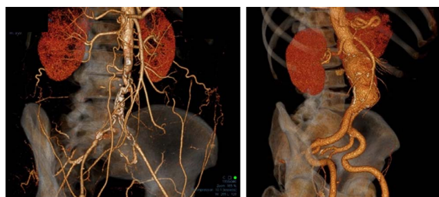
Figure 2. Computed tomography scan revealing aortic-iliac occlusive disease and abdominal aortic aneurysm.

Considering that operating rooms can consume up to and in excess of 40% of a hospital's annual