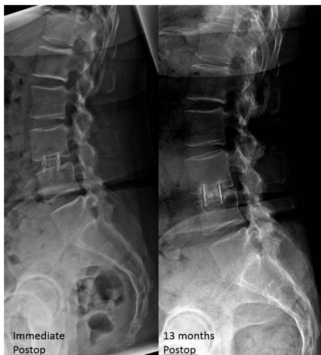
Figure 1. X-rays from a subject in the control group immediately postoperative and at final follow-up, noting significant subsidence of cage.

ing. 9,10 Additionally, a recent prospective, randomized trial followed osteoporotic patients after traditional open spinal surgery. 9 Patients diagnosed with osteoporosis were eligible for enrollment in the study. Treatment was randomized to either vitamin D/calcium supplementation or bisphosphonate treatment for 3 months postoperative. Both treatments were standard of care for patients with osteoporosis. Additionally, many patients with osteoporosis take alendronate currently. The study demonstrated a significant increase in fusion rates and decrease in subsidence in patients treated with alendronate in a transforaminal lumbar interbody fusion model.