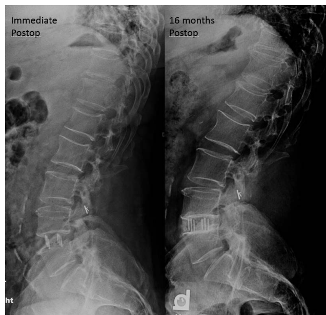
Figure 2. X-rays from a subject in the alendronate group immediately postoperative and at final follow-up, noting no subsidence of cage.

The institutional review board at our medical center approved this study.