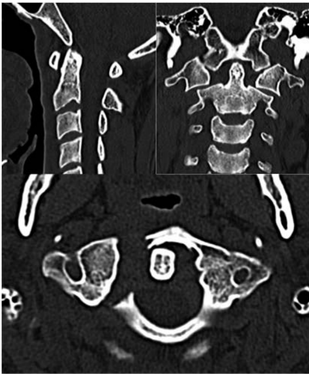
Figure 1. Preoperative computed tomographic scan showing the displaced fracture of the C1 vertebra with increased C1 lateral mass overhang over C2.