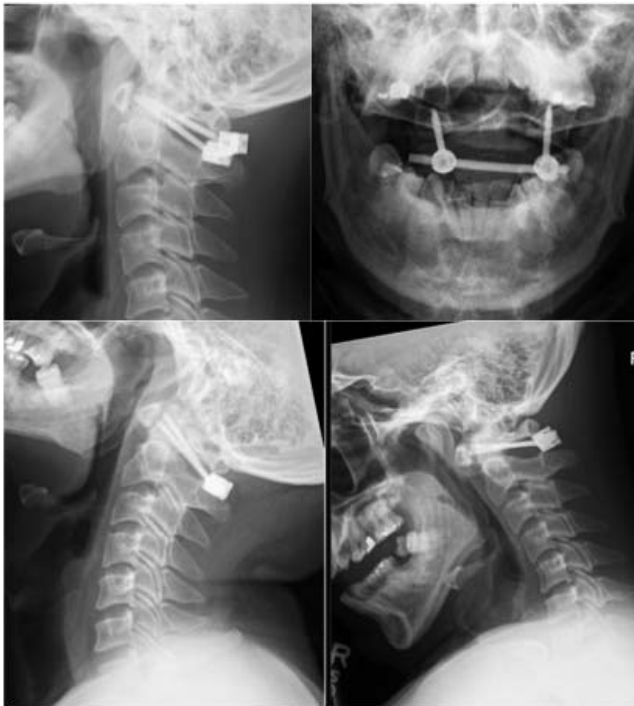
Figure 4. Postoperative radiographs demonstrating the stability of the construct.

inserted before executing a layered closure. An Aspen collar was applied postprocedure.