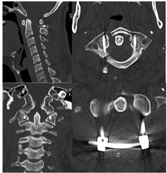
Figure 3. Postoperative computed tomographic scan showing the reduction of the posterior C1 ring and correction of the C1 lateral mass overhang.