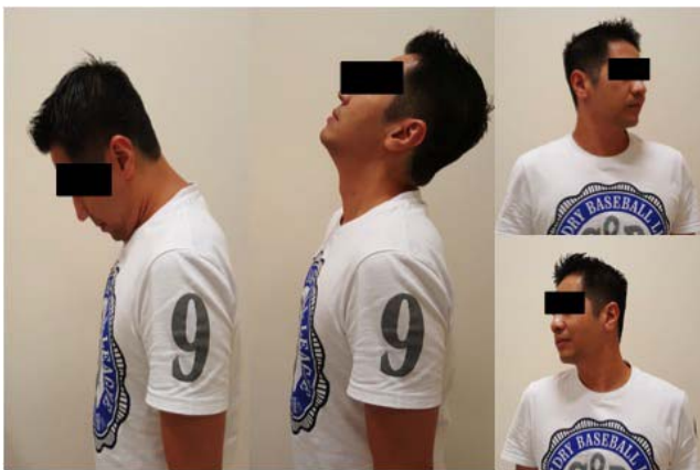
Figure 5. Patient showing near normal range of flexion, extension, and rotation of the cervical spine at 3 months postsurgery.

The patient made an uneventful recovery and was discharged 2 days later. The collar was worn for 6 weeks before weaning off over the subsequent 6 weeks. Follow-up radiographs were performed at 1 and 3 months along with CT scan at 3 months. At 3 months, he demonstrated near full range of motion of the cervical spine, was pain free, and had resumed driving (Figure 5). At 6 months, he returned to work as an airline steward. At 12 months, CT scan