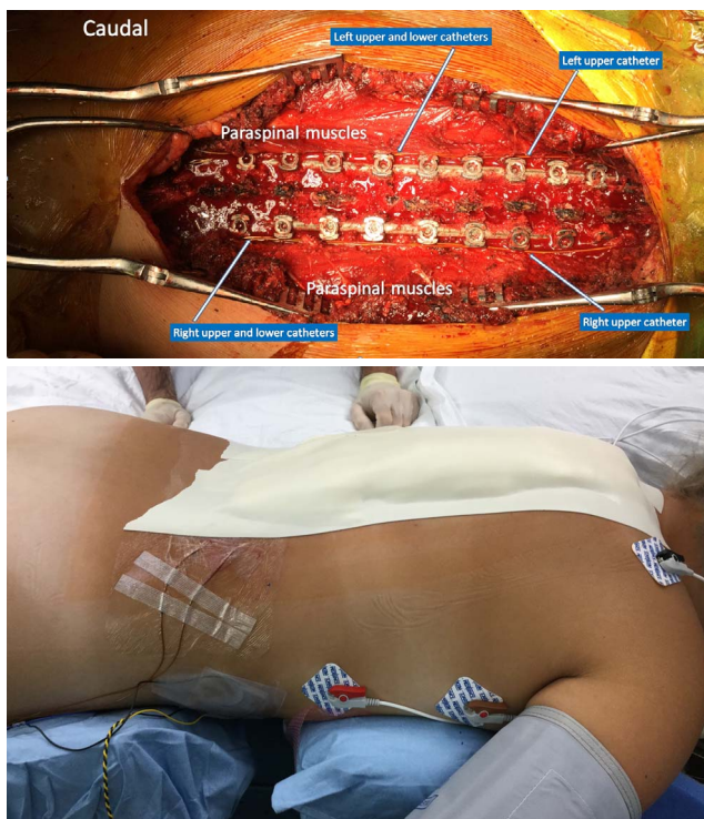
Figure 1. (a) Dorsal ramus nerve catheters prior to closure. (b) Dorsal ramus nerve catheters after closure (right side).

No complications were noted during hospitalization or in the postoperative period. Patients reported their pain was well controlled. Patients were able to participate in physical therapy, eat, and