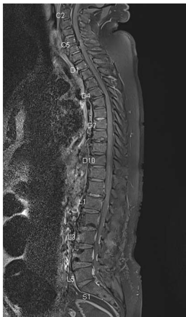
Figure 3. Postgadolinium sagittal MRI of the spine showing no abnormal cord enhancement and no evidence of leptomeningeal enhancement, ruling out inflammatory etiology.

the presence of new onset of back pain after a history of a trivial fall and symptom progression reaching a nadir within 8 hours. In inflammatory conditions, there may be a prodromal illness, and symptom onset may be slow to develop. There was temporal relationship to trivial trauma and presence of degenerated disc at T4–T5 corresponding to the highest level of spinal cord infarction on MRI. Finally, a high likelihood of FCE is established in the absence of major vascular risk factors, such as aortic pathology, diabetes mellitus, smoking, hypertension, prior vascular episodes, peripheral vascular disease, or age of more than 60 years. Although not included in the criteria, the presence of cord enhancement on DWI and corresponding hypointensity on ADC further consolidates the diagnosis