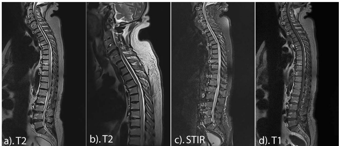
Figure 1. Sagittal images of the spine showing intramedullary hyperintensity extending from T5 to conus region with mild cord edema on T2 and short T1 inversion recovery images (a–c) that is isointense on T1 (d).