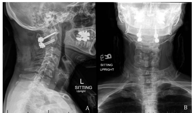
Figure 4. (A) Postoperative C1–C2 instrumented posterior spinal fusion with (B) correction of preoperative clinical torticollis seen on the anterior-posterior view.