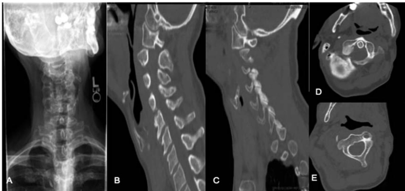
Figure 1. (A) Demonstrates radiographic rotation of the head in the anterior-posterior view. Computed tomography scan showed (B) posterior and (C) anterior subluxation of the C1 lateral mass in relation to the C2 facet. Axial view demonstrated (D) the C1 arch rotated about odontoid, significantly subluxed compared to (E) the C2 vertebrae.

puncture, muscle relaxants, and multiple Botox injections.