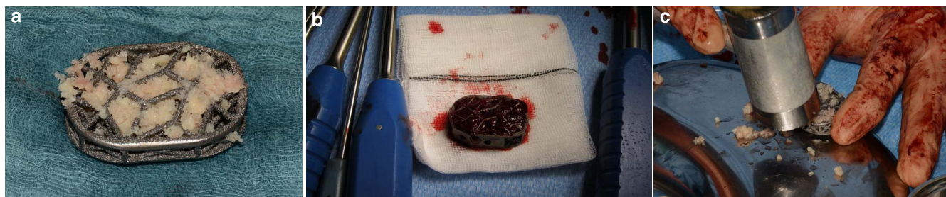
Figure 2. (a) Cage with crushed cancellous bone (CCB) alone packed into the cage. (b) Cage with bone marrow aspirate (BMA) clot packed into the cage. (c) CCB being packed into the cage.