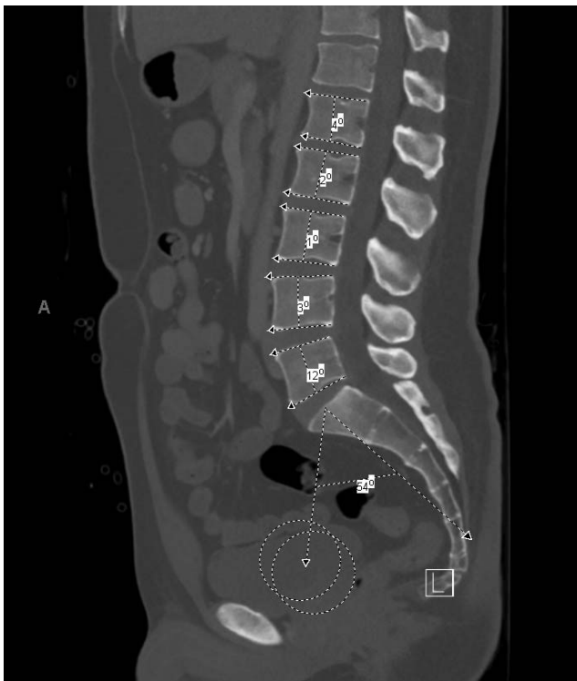
Figure 2. Technique for measuring the pelvic incidence (PI) and segmental vertebral body angles.