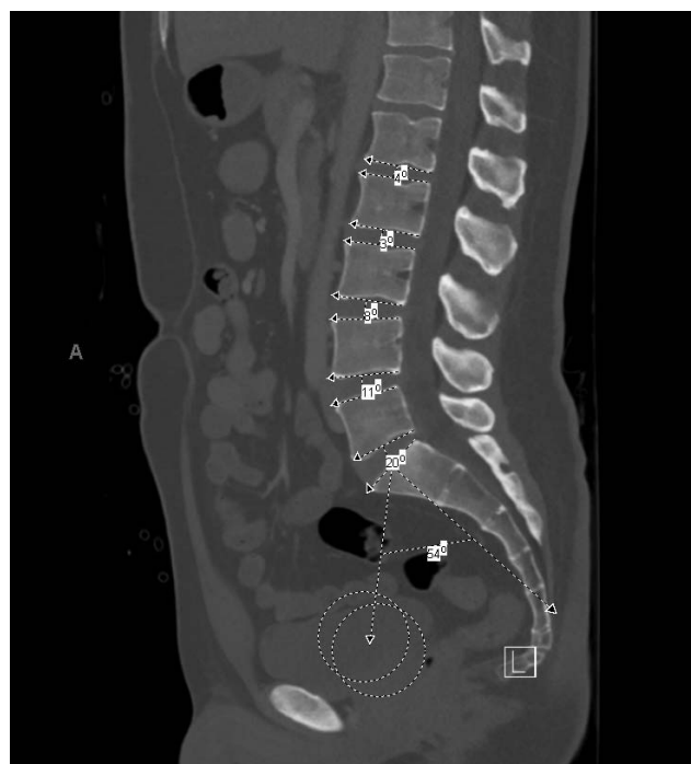
Figure 1. Technique for measuring the pelvic incidence (PI) and segmental disc angles.

In an attempt to minimize pathologic spines from analysis, scans were then excluded from analysis if there was any destructive pathology (trauma, tumor, infection) or previous surgery (spinal fusion, spinal instrumentation, hip arthroplasty) that precluded measurement of sacropelvic parameters or segmental spinal values. Scans were also excluded from analysis if there was evidence of degenerative spinal column disease including the presence of osteophyte, endplate sclerosis, or vacuum phenomena of the disc, and if there was antero- or retrolisthesis or evidence of spondylolysis. All scans were reviewed to determine the presence of 7 cervical, 12 thoracic, and 5 lumbar vertebrae and patients with abnormal numbering