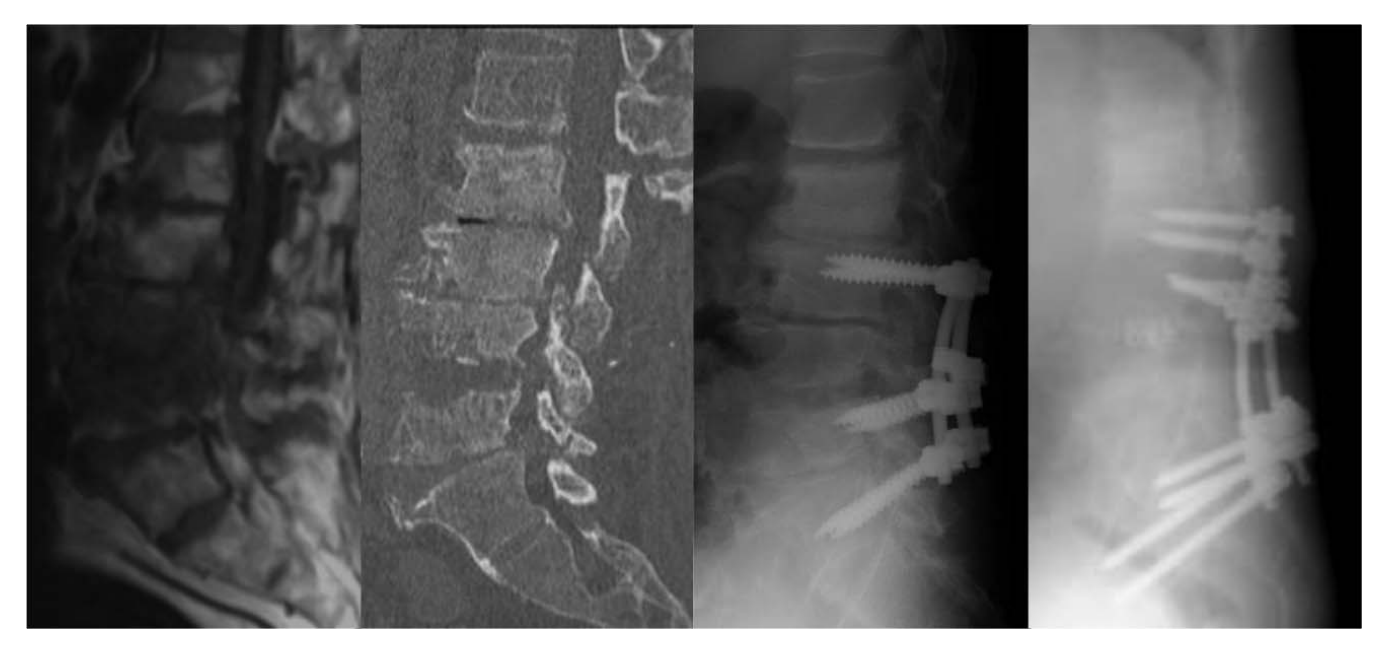
Figure 1. Images of a representative case of Group Skipping. T1-weited magnetic resonance imaging, computed tomography, postoperative x ray, and follow-up x ray. A 75-year-old male patient with L3–4 pyogenic spondylitis undergoing finally L2–iliac fixation 6 months after 2-staged L2–L5 fixation with skipping L3.

single- or 2-stage surgery for posterior instrumentation or approach for interbody fusion (retroperitoneal or posterior) was approved in the same way. Third, pelivac incisence minus lumbar lordosis mismatch or sagittal vertical axis was not discussed in this study because 12 of the 36 patients lost ambulatory ability, and they could not be evaluated in standing position. Fourth, the possibility of the relapse of pyogenic spondylitis could not be excluded during the diagnosis of pseudarthrosis, although all 6 patients who required revision