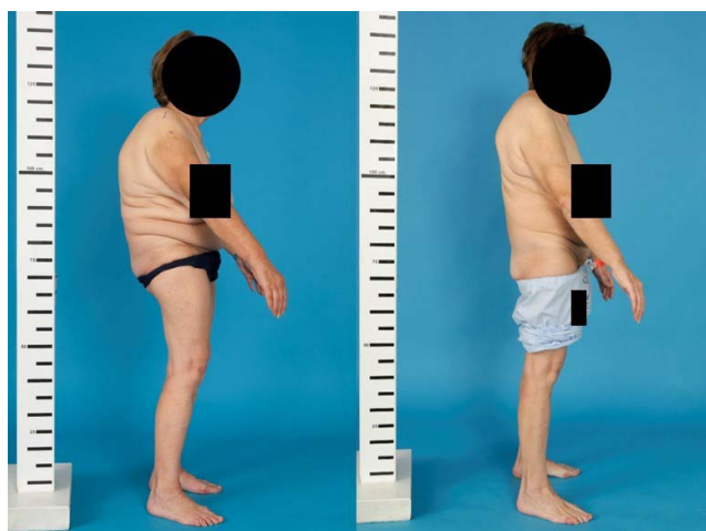
Figure 3. Preoperative and postoperative right-side upright position clinical photographs of a patient operated on for thoracolumbar kyphosis. Patient preoperative picture shows pelvic retroversion and knee flexion as compensatory mechanisms. Final follow-up photograph shows reversal of compensatory mechanisms.

factors can be avoided using the same patients as the control group. 20