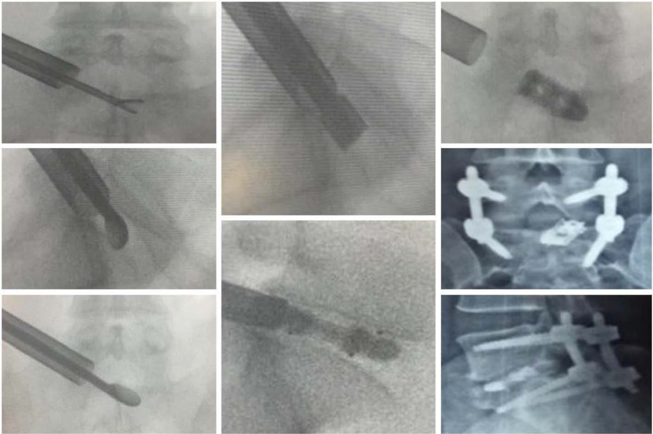
Figure 2. Intraoperative fluoroscopy images were taken during the L5-S1 full endoscopic lumbar interbody fusion (FELTIF) of a 55-year-old woman. The endoscopic discectomy, end plate preparation with currets and shavers, and placement of the interbody fusion cage, as well as postoperative posteroanterior and lateral images are shown.

not associated with a psoas muscle injury, lumbar plexus, bowel and vascular injuries common to lateral or direct retroperitoneal approaches because it enters the spine posterior to the psoas major, thereby avoiding damage to the viscera. We are reporting on a percutaneous, endoscopically assisted transforaminal decompression and fusion surgery version of TLIF named FELTIF. Recent advances in video-endoscopic instrumentation allowed for aggressive bony decompression and foraminoplasty with resection of the lateral part of a hypertrophic facet joint by osteotomy of the anterosuperior migrated SAP. Resection of the SAP with partial pediclectomy and resection of end plate osteophytes for preparation is relevant for adequate decompression of the exiting nerve root in its axilla and creation of an adequately sized entry point for the insertion of the conical interbody fusion cage directly through the endoscopic working cannula. Violation of the end plates during decorication may expose the subchondral bone with vessel injury that is more likely to occur during open