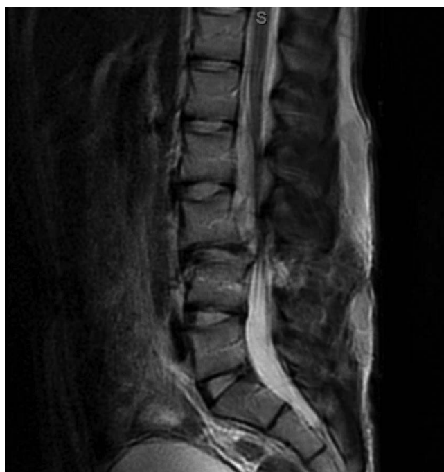
Figure 2. T2-weighted sagittal reconstruction of lumbar spine MRI demonstrating epidural hematoma.

traction and compression of the left L3 nerve root. Due to persistent traction and compression despite laminectomies, further decompression was performed with bilateral facetectomies and neuroforaminotomies for complete decompression of the bilateral L3 nerve roots.