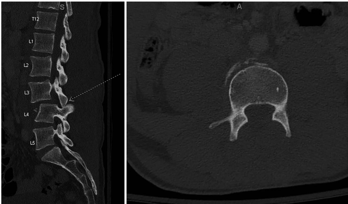
Figure 1. (Left) Bilateral jumped facets at L3-4 seen on injury computer tomography (CT) of lumbar spine. (Right) Axial cut at L3-4 showing empty facet sign.

Computed tomography (CT) scan of the cervical, thoracic, and lumbar spine obtained for trauma evaluation demonstrated fracture dislocation at L3-4 with bilateral jumped facets of L3 on L4 in addition to L4 compression fracture and left L2-3 transverse process fractures (Figure 1). An MRI of the lumbar spine demonstrated severe canal stenosis at the L3-4 level with L3-4 epidural hematoma (Figure 2). Imaging and examination also demonstrated a right great toe fracture dislocation, bilateral pneumothoraces, and evidence of abdominal contusion.