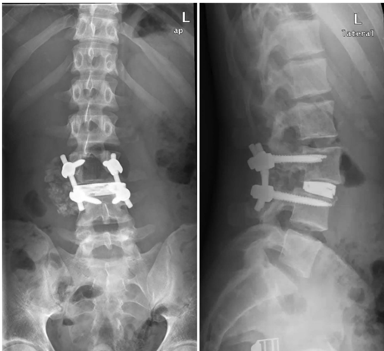
Figure 3. Final construct showing 3-column fusion construct at L3-4.

within the lumbar spine are much less commonly seen, with several total reported cases found in the literature. 6,10,11,15 Bilateral lumbar facet dislocations are rare, with a few total cases described. 12-15 There is only one other reported case of a pure bilateral dislocation outside the lumbosacral junction in an adult. 4 Common to these injuries are the mechanism of a high-speed motor vehicle accident, associated multisystem injuries, including abdominal solid organ and hollow viscus injuries, and prevalence of neurological deficits (more common in bilateral facet dislocations 3 ).