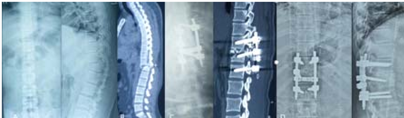
Figure 2. D12–L1 fracture-dislocation in a 41-year-old female. (A) Radiographs anteroposterior and lateral view. (B) Sagittal preoperative computed tomography scan. (C) Postoperative x ray showing reduction of dislocation with long-segment posterior fixation. (D) 6-month follow-up x ray showing well-maintained alignment and fixation.