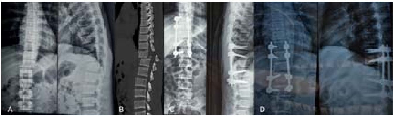
Figure 3. Imaging of a 32-year-old man who had a fall from height. (A) The radiographs (anteroposterior and lateral) and (B) sagittal computed tomography scan show fracture-dislocation at the D12–L1 level. (C) The postoperative radiographs (anteroposterior and lateral) show that the dislocated segment had been realigned to a normal anatomic sequence after short-segment posterior fixation and posterolateral fusion. (D) 16-month follow-up x ray shows no loss of reduction with a good position of the internal fixation.

used for posterior and posterolateral fusion. Patients were mobilized on the second postoperative day and were provided braces for 3 months.