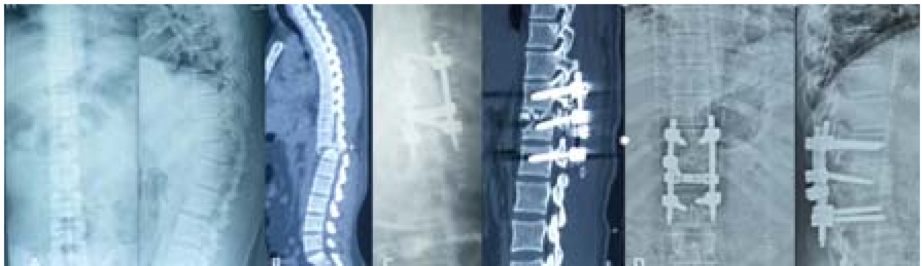
Figure 2. D12–L1 fracture-dislocation in a 41-year-old female. (A) Radiographs anteroposterior and lateral view. (B) Sagittal preoperative computed tomography scan. (C) Postoperative x ray showing reduction of dislocation with long-segment posterior fixation. (D) 6-month follow-up x ray showing well-maintained alignment and fixation.