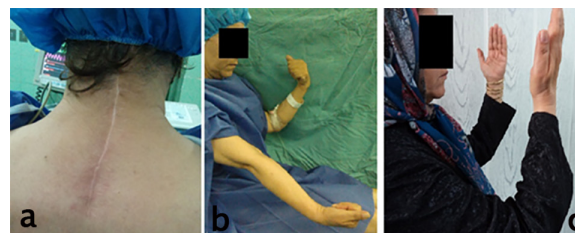
Figure 3. (a), (b) Preoperative examination showed loss of right elbow flexion after posterior laminectomy for the cervical spinal canal stenosis, (c) postoperative examination after double fascicular nerve transfer.