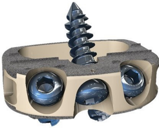
Figure 1. The current design of the STALIF M-Ti device made of polyetheretherketone with texturized titanium surfaces interfacing with the vertebral bodies.

provided sufficient stability, reduced stress in adjacent levels compared with a model with the cage and posterior fixation, and shared the loading distribution in a manner similar to an intact spine. 3 While these biomechanical results are promising, there are relatively little clinical outcome data available in the literature reporting on the use of stand-alone cages, particularly those of a current design type. While in the past, trials were conducted evaluating shaped allograft cages and paired threaded metallic cages, there is relatively little information on the current cage design with integrated screws. The purpose of the current study was to evaluate the clinical outcome of stand-alone ALIF based on commonly used outcome assessments and re-operations.