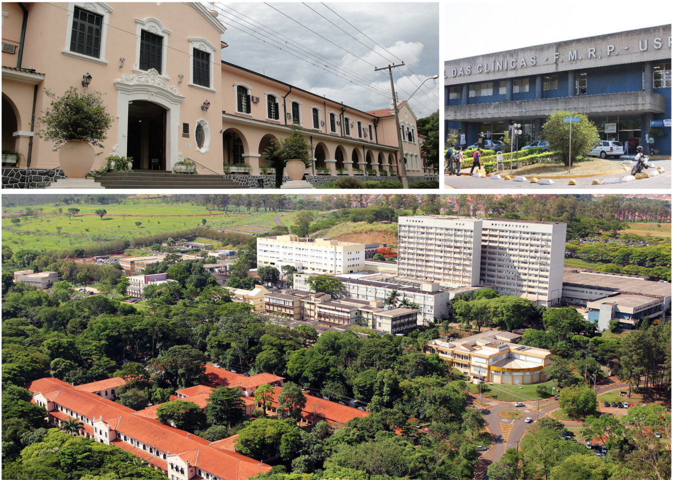
Figure 3. Shown is an aerial view of the central campus of Faculdade de Medicina de Ribeirão Preto—Prédio Central, University of São Paulo (bottom), the original historic medical school buildings (Faculdade de Medicina) (top right), and the main entrance to the university hospital (top left).

surgeries that we are performing for the more complex spinal deformities to improve confounding factors that we can control as a surgical team so that the characteristics of these types of cases do not interfere with the dynamics and flow of treatment. One such article from our team was recently published in the International Journal of Spine Surgery . 13 It illustrates our efforts to perform these long surgeries by deploying our experienced surgeons with specialized deformity surgery training with good stewardship concepts in mind so that our university deformity program can continue despite the high costs of implants and technical resources, frequent readmissions, and reoperations due to the high percentage of complications. Orchestrating the many moving parts within a university hospital setting is essential for sustaining our program since the public health system does not fully reimburses all surgeries.