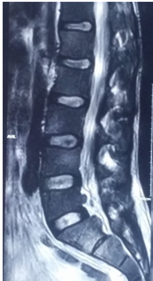
Fig. 1. MRI T2 image of the lumbar spine showing the extramedullary masses in the anterior epidural space at L5-S3.

Because of its rarity no evidence based guidelines for