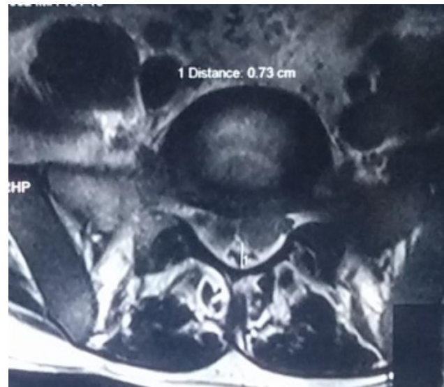
Fig. 3. Axial T2 weighted MRI at the level of S1 showing the anterior epidural space encroached by the extramedullary masses leading to compression.

lent result in upto 50% of patients, with neurological