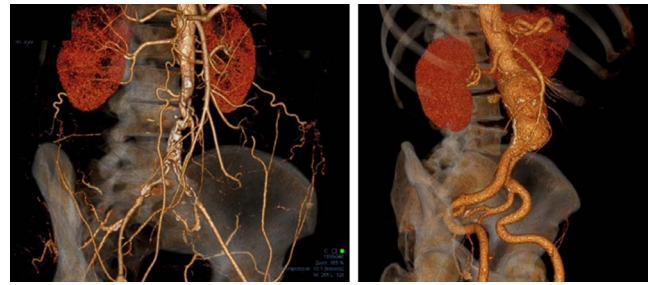
Figure 2. Computed tomography scan revealing aortic-iliac occlusive disease and abdominal aortic aneurysm.

Considering that operating rooms can consume up to and in excess of 40% of a hospital's annual