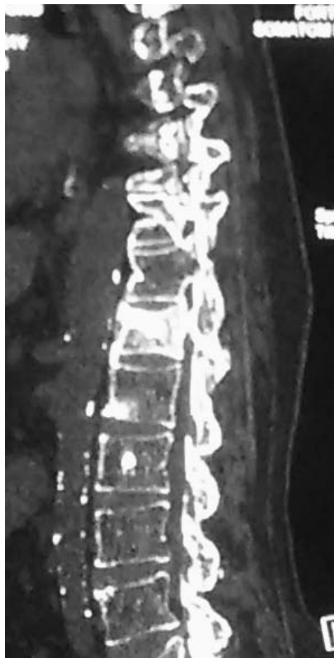
Figure 4. Postoperative sagittal computed tomography showing good penetration of cement at the fracture site (Case 2).