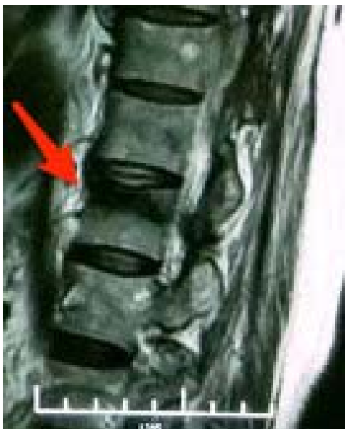
Figure 2. T2 sagittal magnetic resonance imaging showing hyperintense signal adjacent to superior end-plate of T12 vertebra indicating a fracture (Case 1).

the pedicles under fluoroscopic guidance and about 3 mL of bone cement was injected into the void (Figure 3). Appropriate precautions were taken to prevent cement leakage which included cement injection as anteriorly as possible (Figure 4) and turning the patient only after cement hardening. Postoperatively the patient was encouraged to resume walking 4 hours after the procedure with brace support (Figure 5). Follow-up CT showed adequate filling of the fracture site with bone cement (Figure 6) and excellent improvement in ODI and VAS scores were sustained at 2 years (Table).