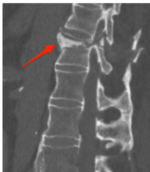
Figure 6. 2-year follow-up computed tomography sagittal image (Case 1).

Abbreviations: ODI, Oswestry Disability Index; VAS, visual analog scale.