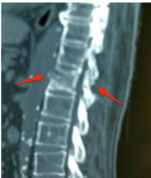
Figure 1. Sagittal computed tomography image showing a 3-column fracture of T12 in ankylosing spondylitis (Case 1).

the pedicles under fluoroscopic guidance and about 3 mL of bone cement was injected into the void (Figure 3). Appropriate precautions were taken to prevent cement leakage which included cement injection as anteriorly as possible (Figure 4) and turning the patient only after cement hardening. Postoperatively the patient was encouraged to resume walking 4 hours after the procedure with brace support (Figure 5). Follow-up CT showed adequate filling of the fracture site with bone cement (Figure 6) and excellent improvement in ODI and VAS scores were sustained at 2 years (Table).