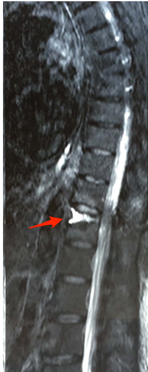
Figure 8. T2-weighted sagittal magnetic resonance imaging showing pseudoarthrosis (Case 2).

In view of the focal instability at the fracture most surgeons/doctors advocate long-segment instrumented fusion. 3,6,10 Generally, the mortality of surgically-treated AS patients is higher than the normal population sustaining spinal trauma. 6 Again, in patients with AS who are medically unfit for surgery, the issues related to management are further complicated in the absence of any set protocol. Brace treatment has been attempted in such cases with questionable relief and poor results. 6,11,12 Specifically, brace treatment in AS patients has high incidence of pseudoarthrosis and consequent pain leading to delay in mobilization, which adds to the morbidity. 6,13-15 Strategies to deal with such patients with persistent pain and high medical comorbidities that preclude surgery are lacking in the literature.