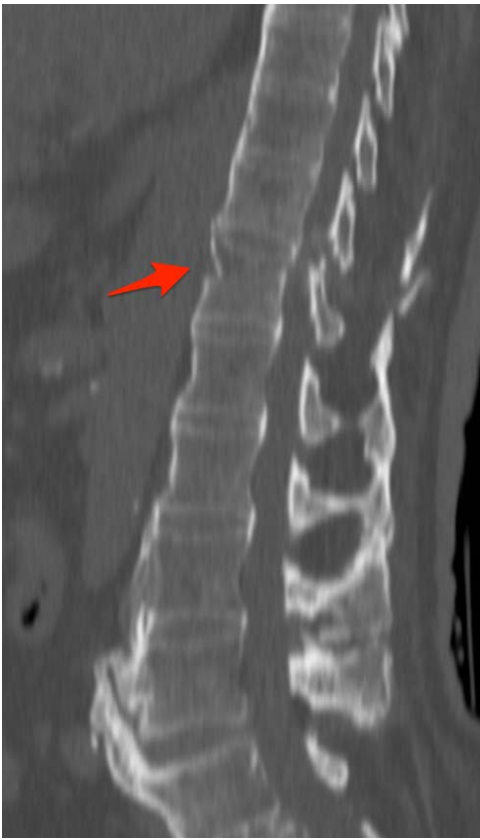
Figure 7. Computed tomography sagittal section showing fracture T12 involving all 3 columns (Case 2).

ma. 5,6 The spinal fractures involve all 3 columns secondary to hyperextension injuries and behave like Chance fractures. 7 The horizontal fracture line can run through vertebral body (bony Chance) or disc space (soft tissue Chance). 8 Following the injury, the traumatic force acts on the long lever arm of ankylosed spine which behaves like a long extremity bone. 3,9