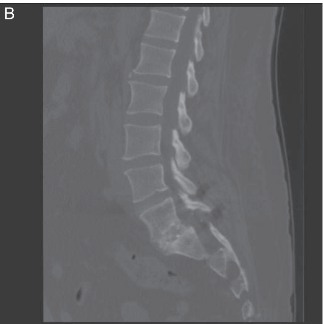
Figure 3. Postoperative (A) coronal and (B) sagittal computed tomographic scans demonstrating a bilateral interbody cage in a patient with grade II isthmic spondylolisthesis.

at L4–L5, left lower extremity radiculopathy, and dorsiflexion weakness. After revision operation, the patient was reevaluated with EMG and noted to have denervation changes in the peroneal muscle, distal to the fibular head. Improved dorsiflexion strength was noted by 18 months postoperatively.