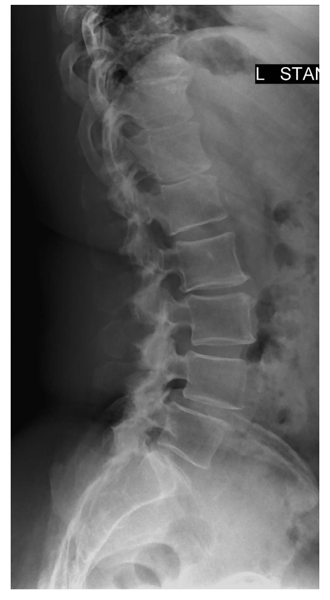
Figure 1. Preoperative radiographs demonstrating degenerative spondylolisthesis at L4–L5.

the interruption of the posterior elements, a low-grade IS patient has an inherent instability that may result in greater anterolisthetic progression compared to a low-grade DS patient.<sup>7–10</sup>