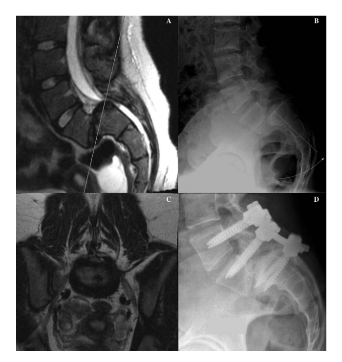
Figure 4. This is a 14-year-old gymnast presented with chronic lower back pain without radicular symptoms. The (A) T2-weighted lumbar magnetic resonance (MR) image and (B) lateral neutral lumbar plain radiograph show exaggerated lordosis and a grade III spondylolisthesis in addition to mild posterior wedging of L5 and mild deformity of the superior S1 end plate. (C) The axial T2-weighted MR image at L5-S1 depicts severe deformity at this level. (D) The patient underwent a laminectomy at L4-S1 with a posterolateral fusion at L4-S and transforaminal lumbar interbody fusion (TLIF) at L5-S1 following a reduction attempt at L5-S1.

The partial reduction and fusion is an adaptation of the reduction and fusion procedure with advantages that include increased fusion rates in patients with an unbalanced pelvis and lower risks of complications compared with a full reduction (Figure 4).<sup>73,74</sup> In this technique, the patient is positioned prone and intraoperative monitoring such as somatosensory evoked potentials or electromyography is used throughout the procedure. The L4-S2 segments are exposed, and a complete L5 laminectomy, and wide decompression of the bilateral L5 and S1 nerve roots is performed. Subsequently, a L5-S1 discectomy and partial excision of the sacral dome is completed to shorten the L5-S1 segment. Pedicle screws are then placed at L4, L5, and S1. A gradual reduction with cantilever flexion of the sacral-pelvis unit follows via a combination of patient positioning and gentle downward force on the sacrum. This