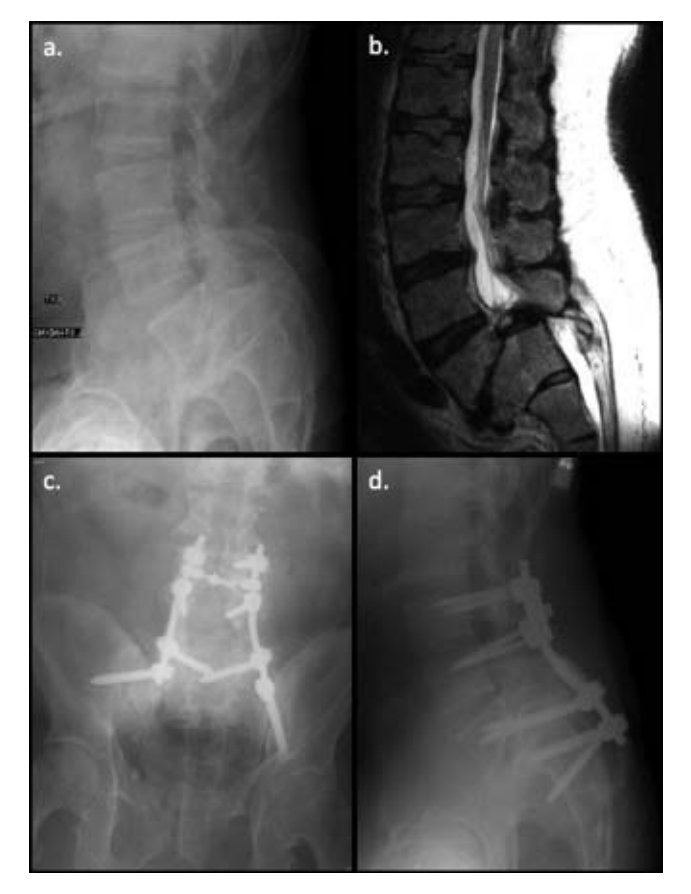
Figure 2. This is a 56-year-old male who presented with right leg weakness and urinary incontinence. (a) Lateral lumbar plain radiograph and (b) T2weighted magnetic resonance imaging of the lumbar spine demonstrated a Meyerding Grade IV spondylolisthesis at L5-S1. As depicted in the (c) anteroposterior and (d) lateral lumbar plain radiographs, he subsequently underwent a laminectomy at L4-S2, a posterolateral fusion from L3-Pelvis, a sacral dome osteotomy, with an additional L5-S1 discectomy and mixed allograft and local autograft placement. No formal reduction maneuver was attempted intraoperatively.

Indications for surgical management of HGS include persistent symptoms, failure of conservative management, radiographic parameters suggestive of imminent slip progression, significant biomechanical stress, and global sagittal imbalance. This section provides an overview of various surgical techniques used in the treatment of HGS in adults, in particular for progression of isthmic slips, which usually present symptomatically when unbalanced. The most common surgical techniques include (1) in situ fusion techniques using posterolateral, anterior, or circumferential approaches; (2) fusion and