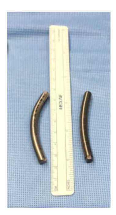
Figure 1. A PSSR (patient-specific spine rod) and a standard prebent rod side by side on a sterile field.

Study data were obtained through a retrospective chart review after institutional review board approval (17-2141). The medical records of patients who underwent posterior spinal surgeries involving 4 or less levels, utilizing PSSR (Medicrea, New York, NY) were compared with the standard rod radius of curvature. All surgeries were performed at a single institution by 1 of 3 surgeons from September 2016 through August 2018. Patient data, specifically the cranial and caudal radii of curvatures (ROCs) for each PSSR, were then compared with the industry standard prebent rod radius of 125 mm (see Figure 1). Note, 3 level fusion PSSR rods had 2 different ROCs designated as the cranial and