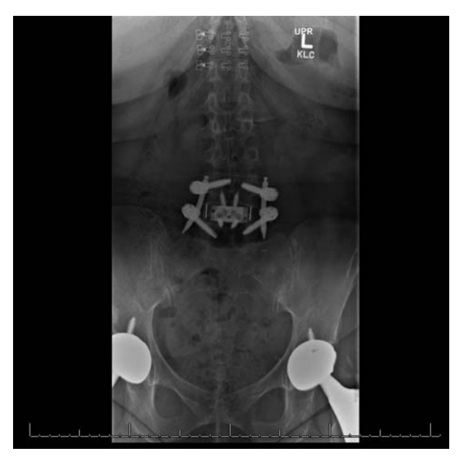
Figure 2. An AP x-ray of the placement of PSSR (patient-specific spine rod) shown 12 months postoperatively from a L4-LF PSF with ALIF (anterior lumbar interbody fusion cages).

analyzed. Out of the 60 rods evaluated, 27 had 2 definite curvatures and 33 had 1 curvature.