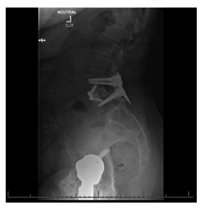
Figure 3. A lateral x-ray of the placement of PSSR (patient-specific spine rod) shown 12 months postoperatively from a L4-LF PSF with ALIF (anterior lumbar interbody fusion cages).

Surgical intervention for degenerative spinal conditions can be an effective treatment, improving patient outcomes. In recent years, the importance of preserving or correcting spinopelvic alignment in degenerative patients undergoing lumbar fusion surgeries has become apparent. There are an increasing number of articles addressing this issue in the current literature. This includes studies referring back to previous literature noting the importance of lumbar lordosis from L4-S1.8 With the understanding that lordosis has a great impact on distribution of weight and force, outcomes can be greatly affected by even a small loss of lordosis during surgical intervention. Many studies indicate that an imbalance of the spinopelvic parameters following lumbar fusion can result in higher rates of