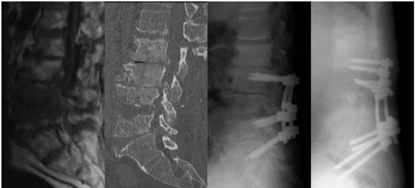
Figure 1. Images of a representative case of Group Skipping. T1-weighted magnetic resonance imaging, computed tomography, postoperative x ray, and follow-up x ray. A 75-year-old male patient with L3–4 pyogenic spondylitis undergoing finally L2–iliac fixation 6 months after 2-staged L2–L5 fixation with skipping L3.

single- or 2-stage surgery for posterior instrumentation or approach for interbody fusion (retroperitoneal or posterior) was approved in the same way. Third, pelvic incision minus lumbar lordosis mismatch or sagittal vertical axis was not discussed in this study because 12 of the 36 patients lost ambulatory ability, and they could not be evaluated in standing position. Fourth, the possibility of the relapse of pyogenic spondylitis could not be excluded during the diagnosis of pseudarthrosis, although all 6 patients who required revision