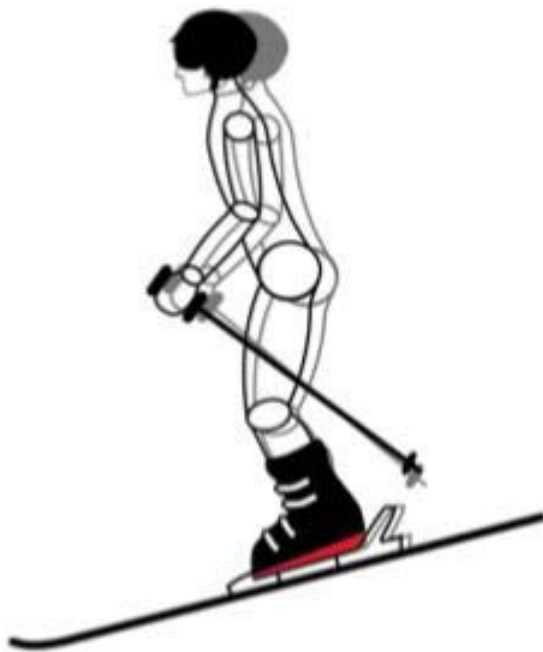
Figure 3. Schematic representation of the patient's postoperative posture with (black) and without (gray) an added heel lift to shift the center of gravity forward.

which can increase the postoperative quality of life and assist with resuming recreational sports