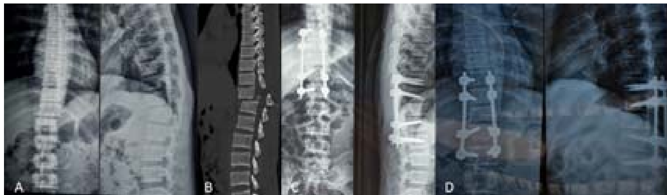
Figure 2. Imaging of a 32-year-old man who had a fall from height. (A) The radiographs (anteroposterior and lateral) and (B) sagittal computed tomography scan show fracture-dislocation at the D12–L1 level. (C) The postoperative radiographs (anteroposterior and lateral) show that the dislocated segment had been realigned to a normal anatomic sequence after short-segment posterior fixation and posterolateral fusion. (D) 16-month follow-up x-ray shows no loss of reduction with a good position of the internal fixation.