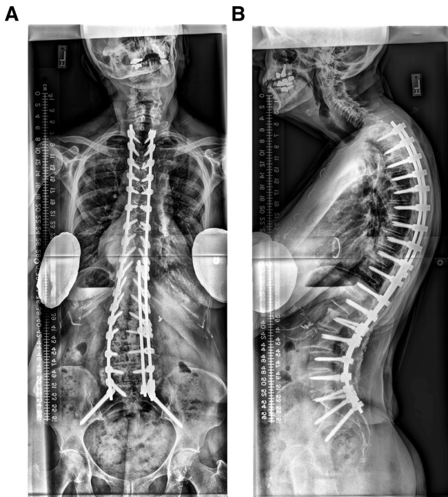
Figure 6. (A) Case example: follow-up coronal radiograph, (B) case example: follow-up lateral radiograph.

reliability of the predictive models created by the ESSG-ISSG calculator.