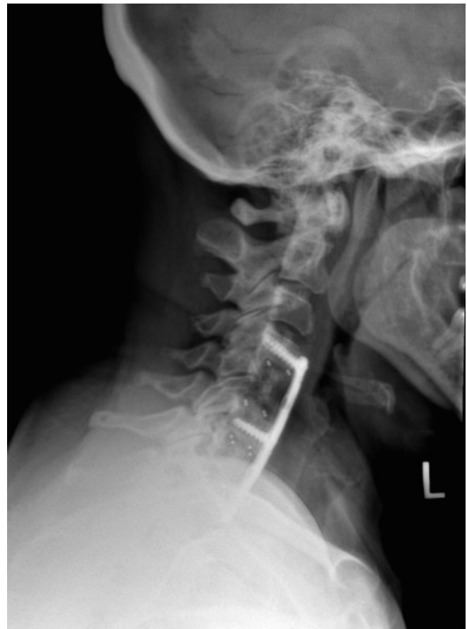
Figure 1. Skip corpectomy involving the C5 and C7 vertebral bodies.

The skip corpectomy procedure performed in this cohort was independently proposed and demonstrated in the early 2000s by 2 authors of the present study (F.F. and S.J.C.). Our technique is similar to that reported by Dalbayrak et al, who described a C4 and C6 corpectomy, C5 osteophytectomy, and decompression of the posterior-superior and posterior-inferior aspects of the C5 vertebral body. 21 In our cohort, a minority of patients underwent corpectomy at C5 and C7 (Figure 1). Pathologic intervertebral discs were removed at the intervening levels. Preservation of the central vertebral body (C5 or C6), as well as the vertebral endplates, is the essential aspect of this technique. Bone from the corpectomy levels was harvested for autograft. The operative microscope was used during resection of the posterior longitudinal ligament. Choice of cage was left to the discretion of the operating surgeon. Cages were packed with local autograft in addition to allograft and/or iliac crest aspirate. Intraoperative radiographs were obtained to confirm proper cage positioning. A fixed