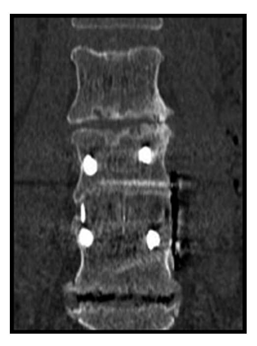
Fig. 1. Computed tomography demonstrates bridging bone across fusion site

Burkus et al,<sup>34</sup> in discussing the largest series of ALIF fusions (679 procedures) in the literature, reported a CT-documented and motion radiograph-confirmed fusion rate of