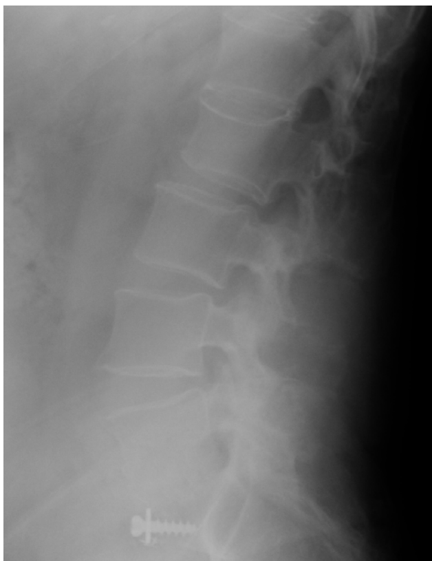
Fig. 3. Baastrup's Syndrome at L4-5 level following L5-S1 fusion.