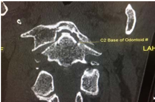
Figure 2. Type 2 odontoid fracture.