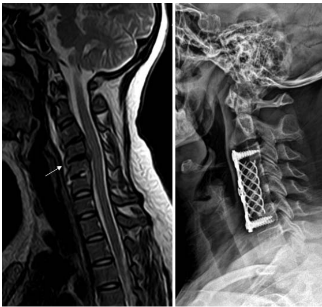
Figure 2. Preoperative cervical spine magnetic resonance image of a patient with grade III pyogenic spondylodiscitis at the C4 to C6 levels (left) and cervical spine lateral radiograph of the same patient at 12 months after anterior cervical corpectomy and fusion surgery (right).

decreased at 6 weeks ( P = .02 ), 3 months ( P < .0001 ), 6 months ( P < .0001 ), and 12 months ( P < .0001 ) after treatment (Figure 4). Similarly, the mean CRP value significantly decreased at 6 weeks ( P < .0001 ), 3 months ( P < .0001 ), 6 months ( P < .0001 ), and 1 year ( P < .0001 ) after treatment when