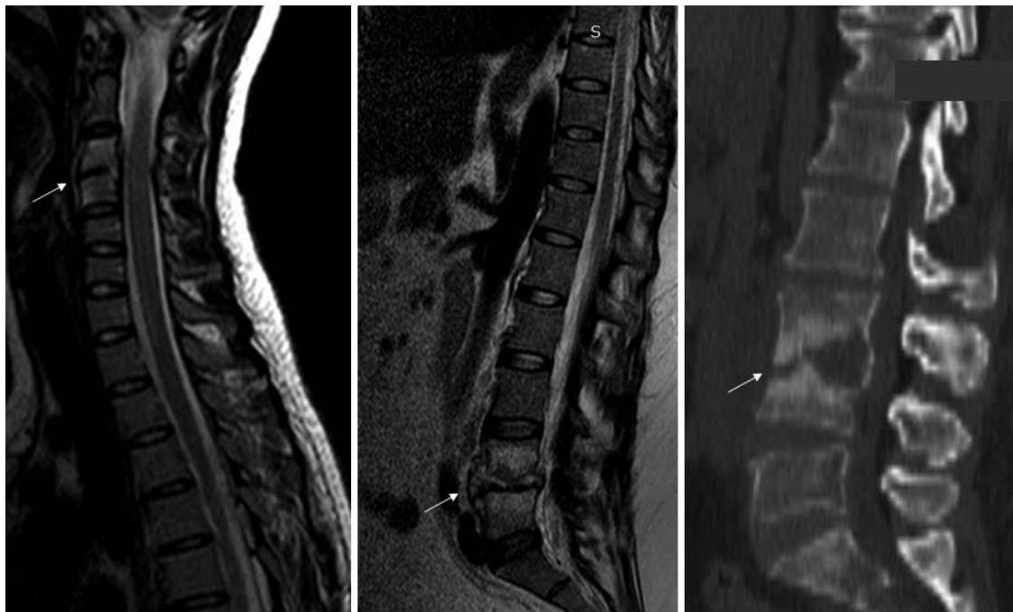
Figure 1. Example of grade I pyogenic spondylodiscitis (PS) at C3 to C4 level (arrow) on magnetic resonance imaging (MRI; left), grade II PS at L4 to L5 level (arrow) on MRI (center), and grade III PS at L3 to L4 level (arrow) on computed tomography scan (right).

The mean pretreatment COMI score of 7.3 \pm 0.7 significantly decreased to 6.1 \pm 0.9 ( P < .0001 ) at 6 weeks, to 2.5 \pm 1.5 ( P < .0001 ) at 3 months, to 0.5 \pm 0.6 ( P < .0001 ) at 6 months, and to 0.2 \pm 0.2 ( P < .0001 ) at 12 months after treatment (Figure 3). The mean pretreatment ESR level significantly