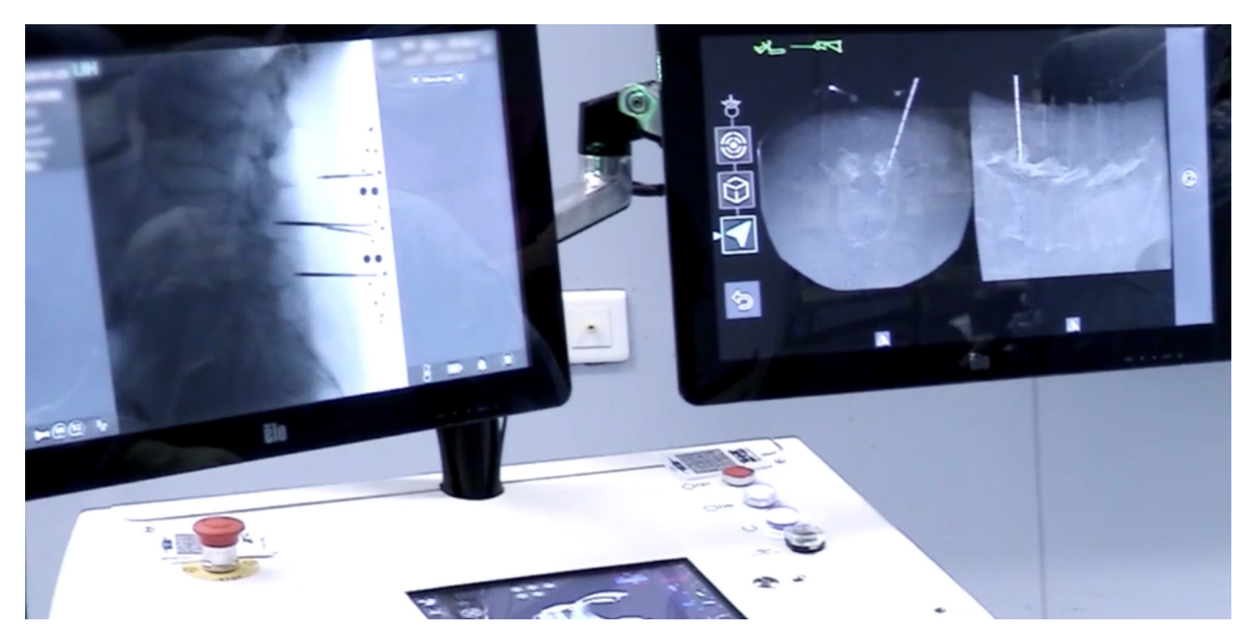
Figure 4. Displayed view of the computerized navigation with Surgivisio for percutaneous cementoplasty.