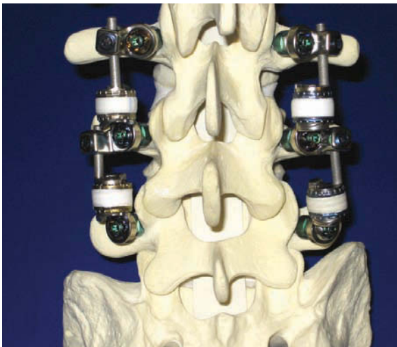
Two-level Stabilimax NZ.

a standard deviation of 1.6 mm. It is important to note that more motion was maintained after instrumentation with the Stabilimax NZ than has been found with fusion constructs. 35,36 (A more detailed analysis of this data has been accepted for presentation at the 2007 Annual Meeting of the International Society for the Study of the Lumbar Spine.)