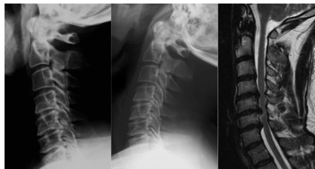
Fig. 3. 62 year old male complained of neck pain and stiffness, and difficulty of ambulation for 3 years: (a,b) X-ray lateral view of pre-operative three-level (C4-C7) CSM. Segmental lordosis 10°, Torg/Pavlov ratio at C6: 0.6, (c) Preoperative sagittal MRI showing the presence of three-segment (C4-C7) spinal cord compression associated with T2 signal changes.