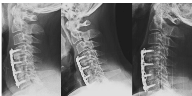
Fig. 4. Fig 4. Postoperative images of the same patient at one year follow. (a) X-ray lateral view 1 year post operation. Fused segmental lordosis 20° (b, c) Rx- lateral view flexion and extension showed that all fused segment are stable. In this case an additional screw is used to secure the bone graft, obtaining good final results in relation to the fusion rate.

The demographic clinical data are summarized in Table 3. Of the 15 patients, 8 were male. The average age was 64.8 years. The average blood loss was 265 \pm 172 mL. The average operative time was 170 \pm 51 min. The follow-up period was 29.6 \pm 9.4 months. The average preoperative JOA score was 11.4