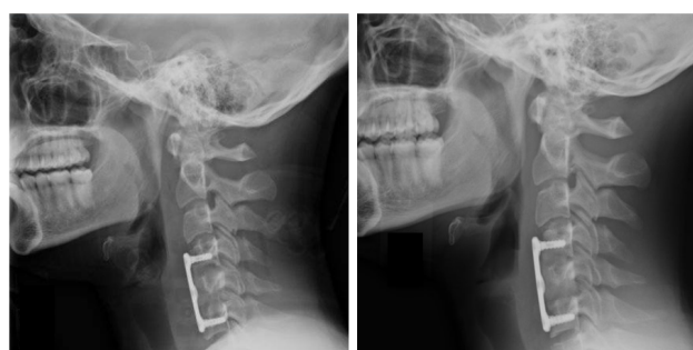
a) post-op: anterior fusion

We measured 4.0 mm midsagittal canal occlusion from the post-injury CT due to retropulsion of the C5 posterior VB fragment (Figure 1 B). While the magnitude of transient canal occlusion during impact was not known, previous biomechanical studies suggest that it was significantly greater than that measured clinically from the post-injury radiographic images. 16,17 The biomechanical studies indicate that the