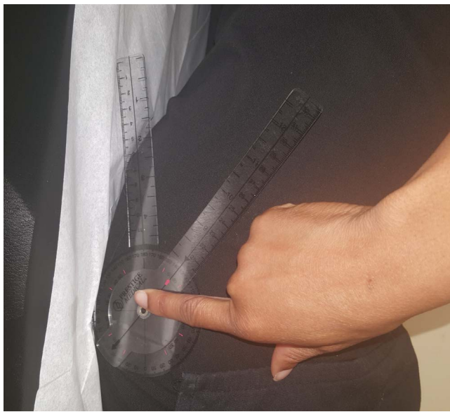
Figure 2. Technique of measuring straight-leg raise in supine position.

floor, as well as the location of the pain (Figure 1). 8 We ensured that, during measurement, the patient's back was straight and the patient did not roll to the affected side. During the supine SLR tests, patients lay on their backs with their hips and knees flat on the table. Each leg was passively and gently raised and flexed at the hip by the same examining physician with his hand beneath the heel, while keeping the knee straight. When the patient complained of low back, buttock, and/or radicular pain down the legs, the angle of hip flexion as well as the location of the pain was recorded (Figure 2). 3 This was also confirmed clinically by the examiner flexing the knee at this angle to check for relief or if the patient still complained of pain. 19 Patients with negative SLR tests in both sitting and supine positions (3 patients) and those patients who had previous hip or spine contractures (15 patients not enrolled) were excluded from the study. Patients with sciatic complaints referable to nerve roots from L4 to S1 were included. A negative SLR was recorded with any angle measured as \geq 75^\circ . 10