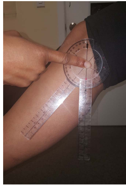
Figure 1. Technique of measuring straight-leg raise in sitting position.

Patients presented to the spine clinic with HNPs, radiculopathy, and spondylolisthesis. We were particularly interested in the diagnosis of HNPs (Table 1). For each patient, documentation of