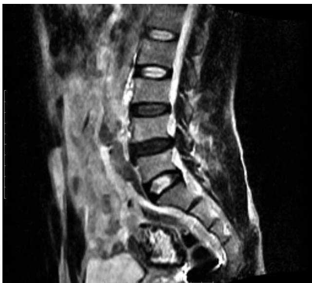
Figure 4. Sagittal magnetic resonance imaging demonstrating herniated disc at L4-5, L5-S1.

The SLR test has been accepted as the most consistent test for applying tension to the nerve root, eliciting a physical sign that is used to aid in the diagnosis of low back pain and radiculopathy. 22-24 The ease and reproducibility of performing the SLR test by physicians has therefore shown its merits. Studies have confirmed that the SLR test is reproducible during unilateral and bilateral maneuvers. 25-27 A study by Hunt et al., 28 however, has shown the SLR and lumbar ranges of motion tests have not been reliable. Their study has some discrepancies in that measurements were performed by multiple examiners on separate days, and the test subjects were volunteers without pathology. Our study aimed to reduce these confounding factors using 1 examiner and not prompting patients with pathology, increasing the reliability of measurements recorded. Patients were blinded to the difference of each test and its clinical significance.