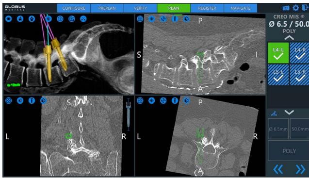
Figure 1. Preoperative planning of screw trajectories. The surgeon positions each screw in the desired trajectory in all 3 planes. The upper left hand quadrant is a ghost reconstruction with the virtual screws superimposed.

purpose of this nonindustry funded study was to describe a single institution's experience with novel robotic navigated system in placing thoracolumbar and pelvic fixation, using screw-related complications as the primary outcome measure.