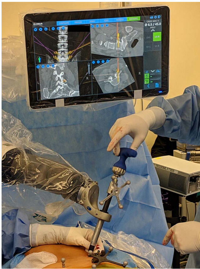
Figure 2. Intraoperative photo of screw insertion through the robotic arm. The screw is displayed overlying the CT on the display.