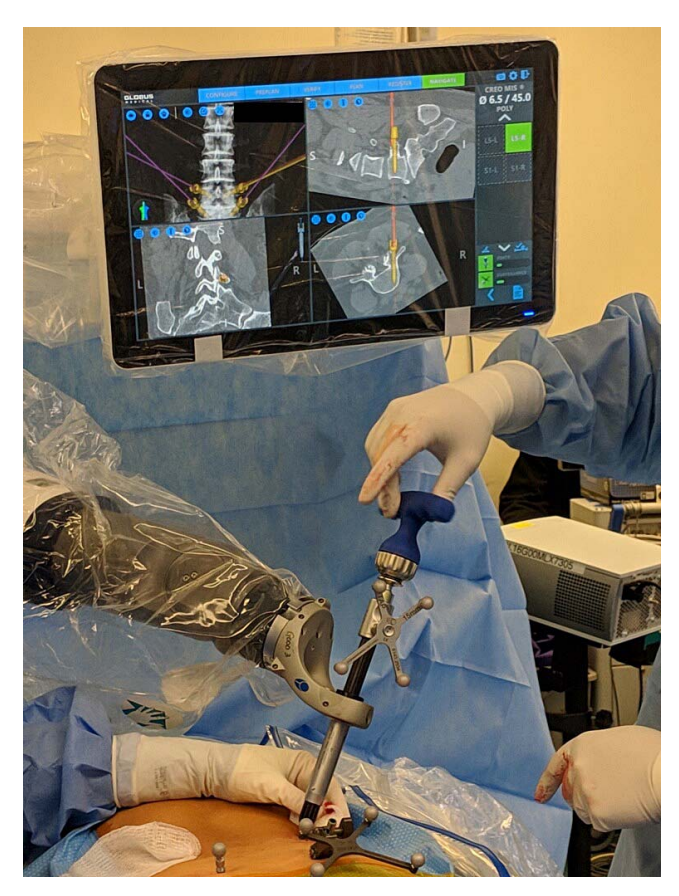
Figure 2. Intraoperative photo of screw insertion through the robotic arm. The screw is displayed overlying the CT on the display.