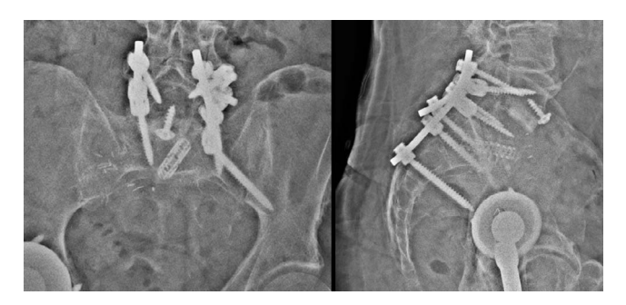
Figure 5. Postoperative standing anterior-posterior and lateral x-ray showing the L4-ilium construct with an L5–S1 reverse Bohlman placement of the transvertebral transsacral titanium mesh cage.

Surgical management of spondylolisthesis varies considerably and is influenced, in part, by surgeon preference, patient age, and biology. The lack of consensus regarding treatment stems from a lack of Level I or Level II studies to date addressing the optimal method for dealing with this condition. Some investigations have suggested that a combined anterior and posterior approach rather than either alone results in lower pseudarthrosis rates and better long-term outcomes.<sup>18–22</sup>