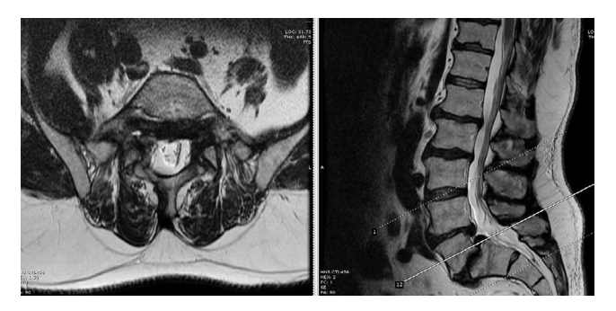
Figure 2. Axial and sagittal magnetic resonance imaging showing the L5–S1 Grade 2 spondylolisthesis with associated bilateral foraminal stenosis.

A 54-year-old man presented with severe lowback pain associated with bilateral leg pain dating back several years. He reported numbness, paresthesias, and lower extremity weakness at baseline, which had all acutely worsened in the context of a recent ground-level fall. His Oswestry Disability Index (ODI) was 38. He had a normal neurologic exam. Plain radiography revealed Grade II isthmic spondylolisthesis at L5–S1 with the following spinopelvic parameters: 73° sacral slope, 82° lumbar lordosis, 12° pelvic tilt, and 94° pelvic incidence (Figure 1). Magnetic resonance imaging of the lumbar spine demonstrated bilateral L5 pars defects