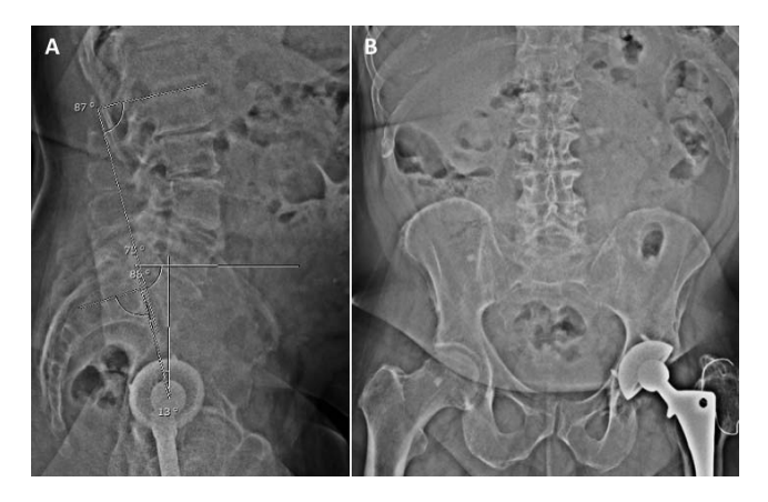
Figure 1. Preoperative anteroposterior and lateral standing radiographs obtained in a 54-year-old man with low-grade spondylolisthesis. Spinopelvic parameters were as follows: 73^{\circ} sacral slope, 82^{\circ} lumbar lordosis, 12^{\circ} pelvic tilt, and 94^{\circ} pelvic incidence.

fracture or resorption, continued slippage, pseudarthrosis, and recurrent instability.<sup>8–10</sup>