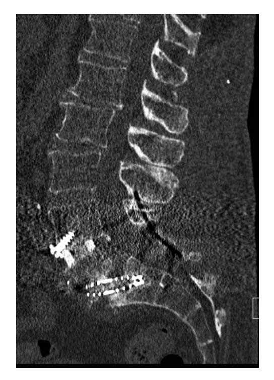
Figure 6. Postoperative computed tomography showing placement of the L5– S1 transvertebral transsacral titanium mesh cage.

The Bohlman technique was originally developed in 1982 due to the high rates of fusion failure of posterior and posterolateral fusions alone, along with the higher morbidity associated with the transabdominal approach in combine operations.<sup>6</sup> In this approach, a single-stage decompression with posterolateral and interbody fusion was used with 2 posterior transsacral autograft fibular strut grafts. Through that single posterior incision, L3 to S2 was exposed, the L5 and S1 nerve roots were decompressed with wide foraminotomies, the sacral prominence was osteotomed, and both a wire and subsequent cannulated drill bit was carefully guided into the S1 body and slipped L5 body anteriorly under fluoroscopic guidance. The fibular strut grafts were inserted and countersunk into these prepared tracts. There was no reduction of the originally described lumbosacral spondyloptosis, and since then, the technique has been shown to have very satisfactory clinical outcomes in patients with highgrade L5-S1 spondylolisthesis.