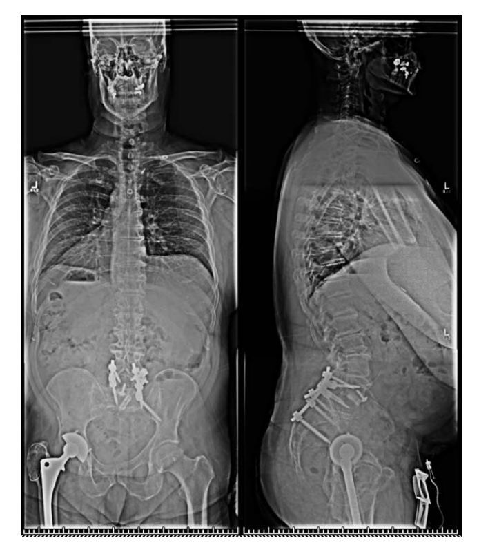
Figure 7. Three-year follow-up anterior-posterior and lateral standing films showing maintenance of his overall global alignment without any evidence of instrumentation failure.

The reverse Bohlman method is generally indicated when conventional interbody approaches are not technically feasible at the lumbosacral disc space and intervention is also required at an adjacent segment. It offers several advantages: (1) elimination of durotomy risk and nerve root injury through