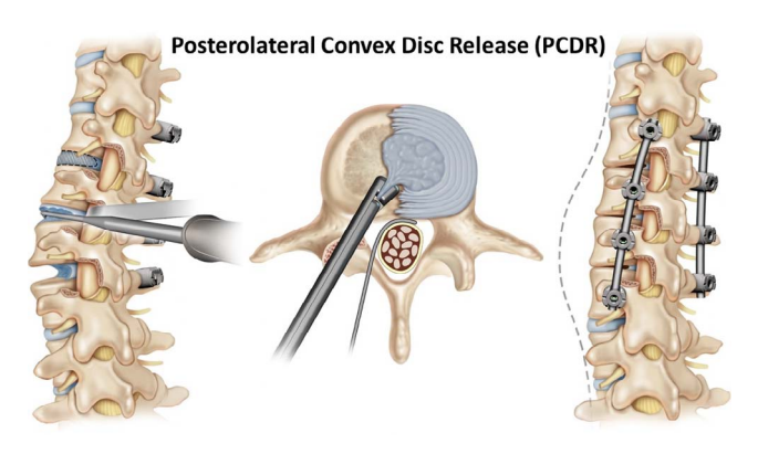
Figure 1. Illustration of PCDR technique.