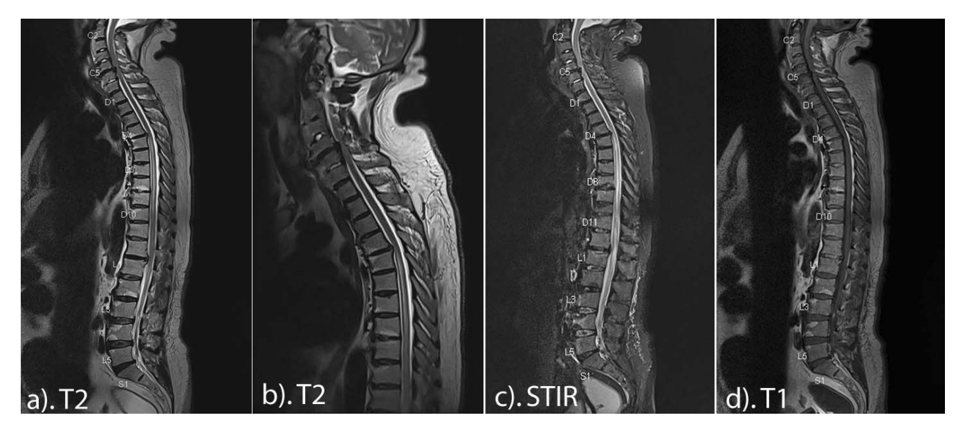
Figure 1. Sagittal images of the spine showing intramedullary hyperintensity extending from T5 to conus region with mild cord edema on T2 and short T1 inversion recovery images (a-c) that is isointense on T1 (d).

the MRI image when no cause has been identified.<sup>7</sup> It is found at an average of 22 years in young patients and 60 years in older patients and shows a bimodal distribution.<sup>8</sup> It is more common in females and involves mostly the cervical spine.<sup>8</sup>