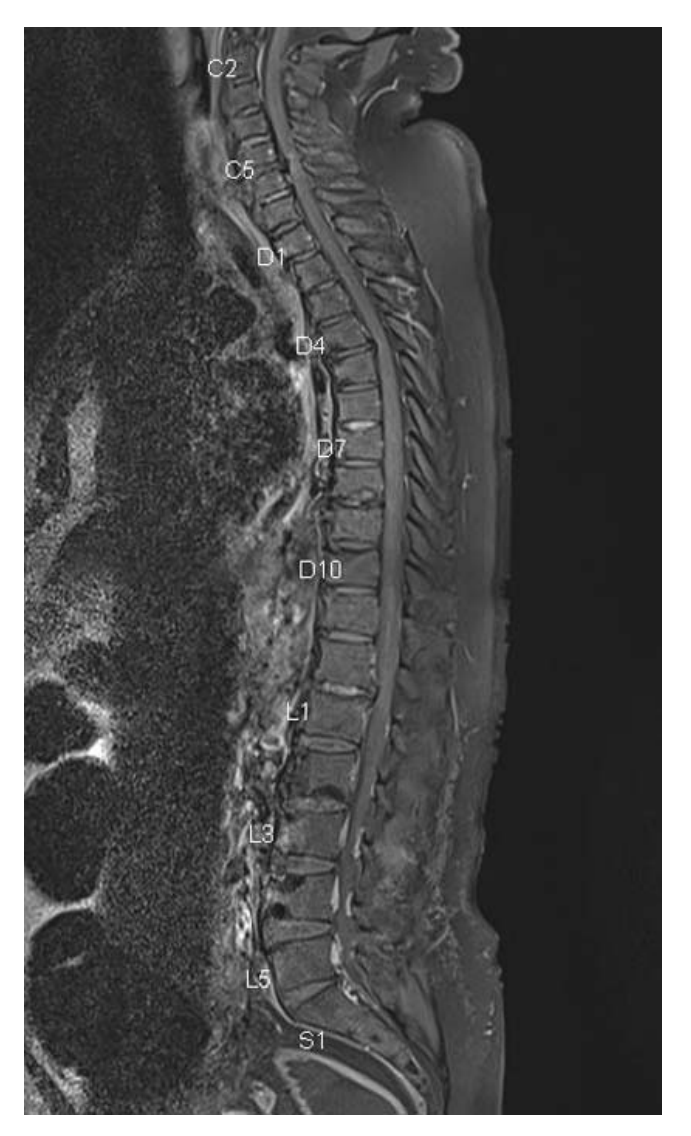
Figure 3. Postgadolinium sagittal MRI of the spine showing no abnormal cord enhancement and no evidence of leptomeningeal enhancement, ruling out inflammatory etiology.

the presence of new onset of back pain after a history of a trivial fall and symptom progression reaching a nadir within 8 hours. In inflammatory conditions, there may be a prodromal illness, and symptom onset may be slow to develop. There was temporal relationship to trivial trauma and presence of degenerated disc at T4-T5 corresponding to the highest level of spinal cord infarction on MRI. Finally, a high likelihood of FCE is established in the absence of major vascular risk factors, such as aortic pathology, diabetes mellitus, smoking, hypertension, prior vascular episodes, peripheral vascular disease, or age of more than 60 years. Although not included in the criteria, the presence of cord enhancement on DWI and corresponding hypointensity on ADC further consolidates the diagnosis