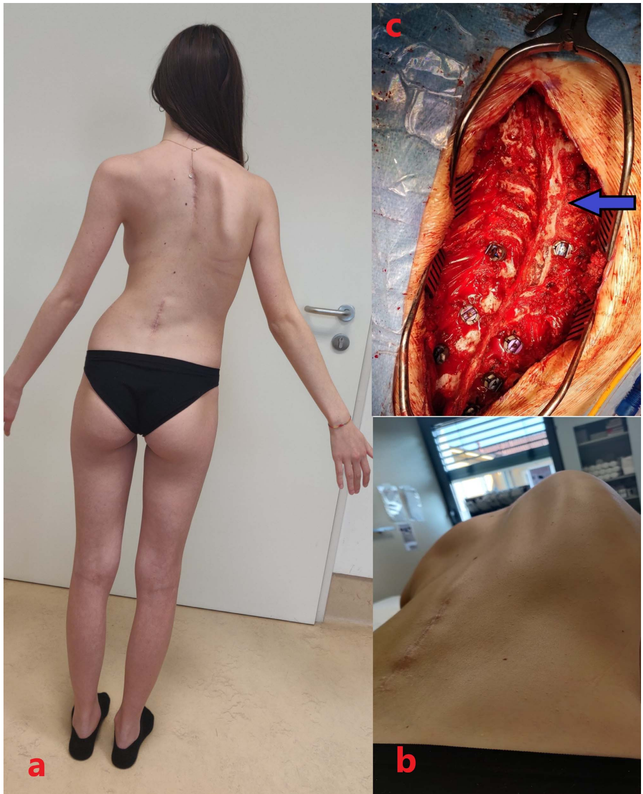
Figure 3. 2 o case. a) The clinical image, at 10 months after removal of Magec rods, shows the clear worsening, with an unbalanced trunk and shoulders. b) The clinical image, at 10 months after removal of Magec rods, points out a severe ribs hump (Adams test). c) The intraoperative picture, during the final instrumented fusion, shows an arthrodesis (blue arrow) on the convexity side of the thoracic curve, a sign of spontaneous autofusion.