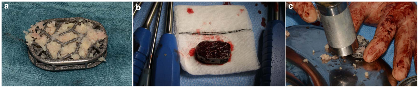
Figure 2. (a) Cage with crushed cancellous bone (CCB) alone packed into the cage. (b) Cage with bone marrow aspirate (BMA) clot packed into the cage. (c) CCB being packed into the cage.